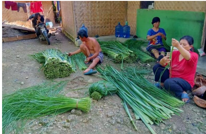
Fig. 5: The Activities of Craftsmen Processing of Pandan Raw Materials

The community of the pandanus craft group appears to get additional livelihoods that can help meet their growing daily financial needs, as seen by the four points (a–d) above. Implementing the pandanus intercropping scheme can also guarantee that the supply of raw material requirements may be regulated sustainably.