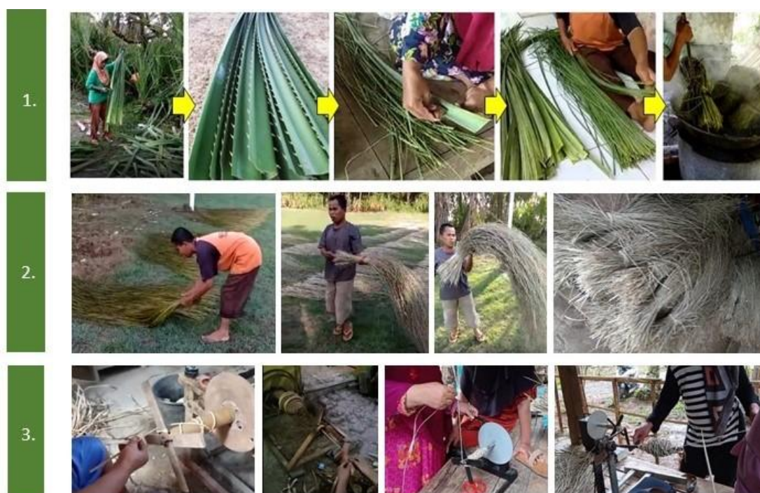
Fig. 4: Processing The Pandan Ropes ( Pandanus Tectorius Rope)

Based on field data, community empowerment (Creative-preneurship) resulted in four groups of pandanus craftsmen from Cibenda Village, Legok Jawa Village, Ciparanti Village, and Kertamukti Village. The craftsmen are divided into three groups based on the type of work they do: