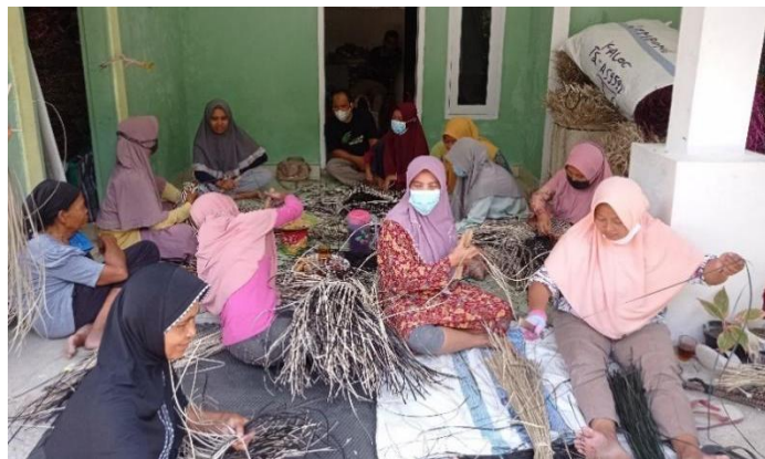
Fig. 6: The Activities of Pandan Woven Craftsman