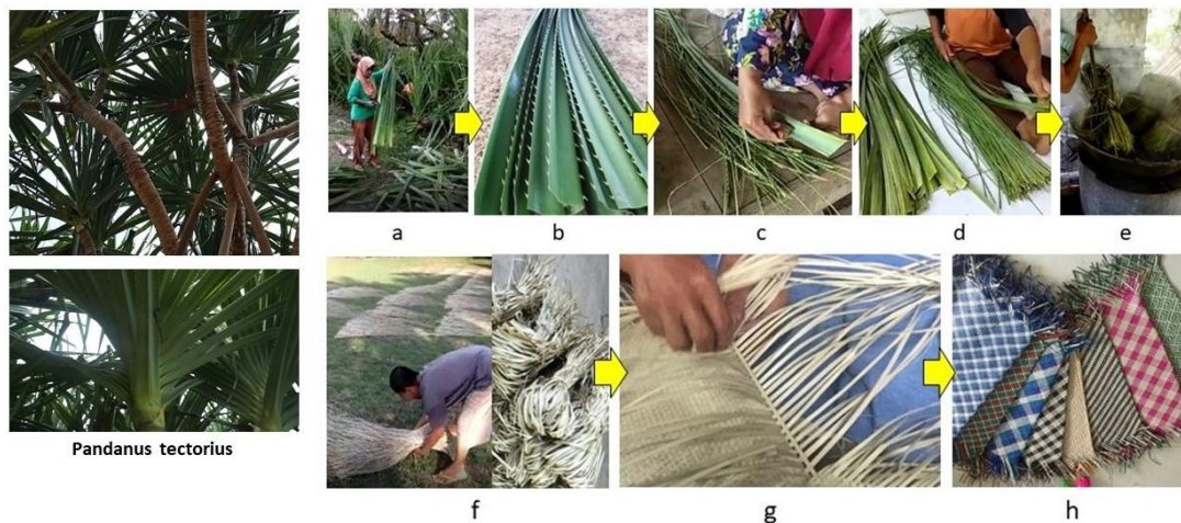
Fig. 3: Weaving Processes of Pandan ( Pandanus Tectorius )