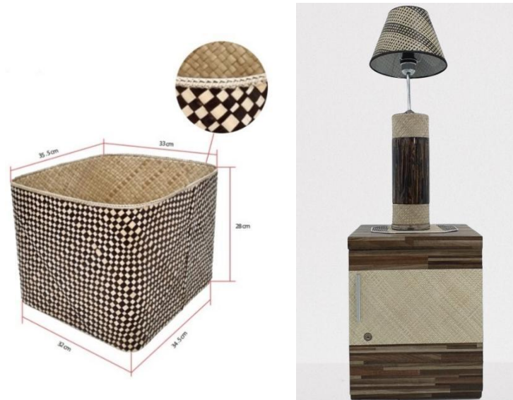
Fig. 7: Pandanus Storage, dan Standing Lamp

Innovation and the value of novelty sometimes refer to profound ideas and concepts but rather to the importance of advantages for users in urban and rural areas. The quality of a product is not defined by the perceived value of its concept and theory or its kitschiness but by its significance and usefulness to the community (Hendriyana, 2019-2021). The importance of this kind of work often lies in the use of inclusive and empathetic design, connecting to diverse societal living spaces and creating new societal living spaces from solid and caring social interactions (Viderman & Knierbein, 2020). The processing of these concepts, ideas, and innovations can be combined to create the following product prototypes.