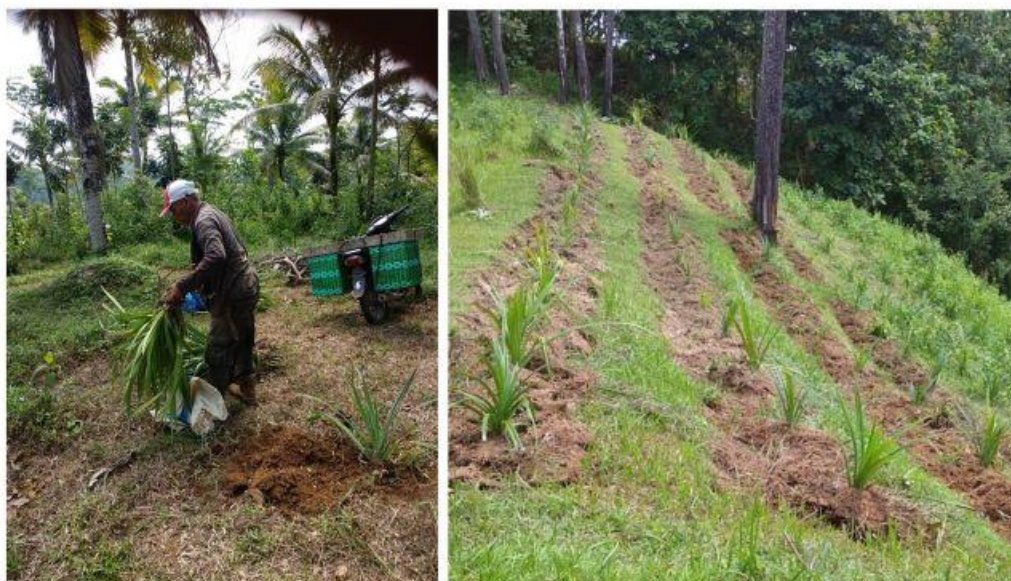
Fig. 9: Planting Pandan Seeds Will Help Ensure a Sustainable Supply of Raw Materials Source: Authors