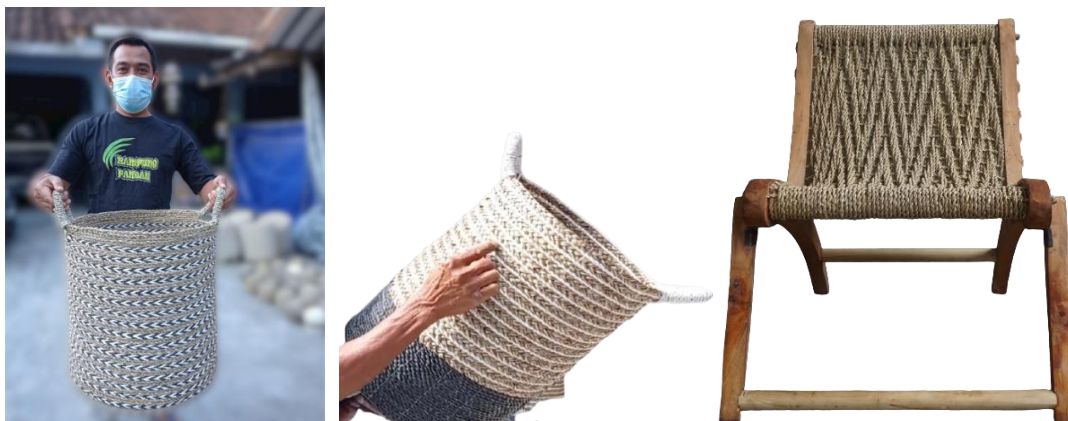
Fig 8: Multifunctional Basket and Patio Chairs

Description: Left, the position of the shopping bag is neatly folded and simple, so it looks fashionable. On the right, the position of the open shopping bag is filled with groceries.