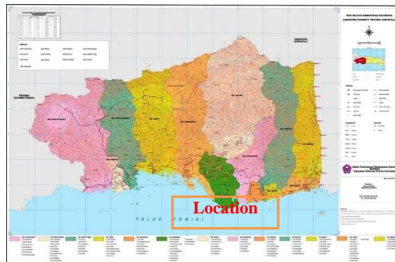
Fig 1: Pohuwato District Map