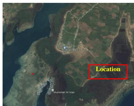
Fig 2: Research Site at Torosiaje Laut Village

The research site was one of the villages of the Bajo tribes that occupied the Gorontalo region of the village of Torosiaje Laut. The village of Torosiaje Laut is one of the villages located in the Pohuwato district, Pohuwato, Gorontalo pProvince that has considerable natural resources potential because of the condition of the region on the gulf coast of Tomini with a typical characteristic of society. The village of Torosiaje Laut was scouted from the village of Torosiaje, a settlement of the Bajo tribe.