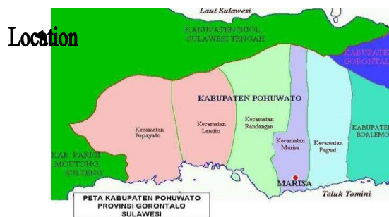
Fig 3. Pohuwato District Map

Pohuwato District is one of the districts in the Gorontalo Province with an area of 4,244.31 km 2 or 34.75% of the total area and-of Gorontalo Province with a population of 149,297 soulspeople . (BPS Pohuwato, 2022)