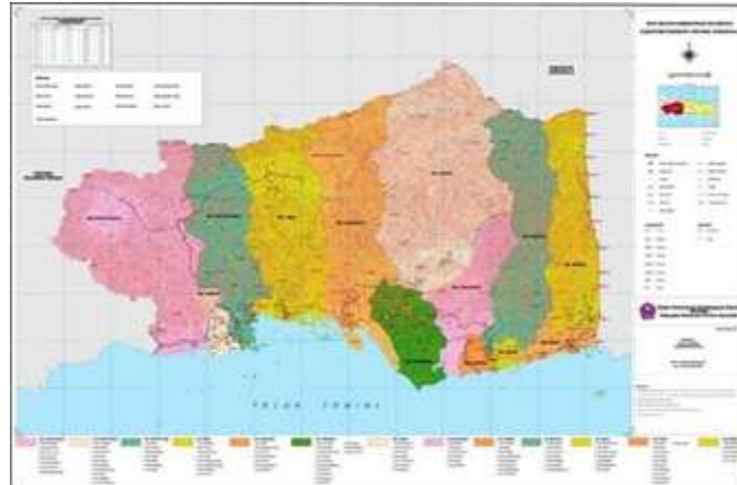
Fig. 1: Pohuwato District Map

Geographically, the settlement of the Bajo Torosiaje Tribe is located in the Popayato Subdistrict, Pohuwato District, Gorontalo Province. There are three Bajo villages in Torosiaje. First, the Bajo villages of Torosiaje Jaya and Bumi Bahari are located on the mainland, and second, the Bajo village located above the sea is the village of Torosiaje sea. With a wet tropical climate, the area is dominated by a population with significant livelihoods as fishermen. The distance from the capital of Gorontalo Province to the village of Torosiaje is approximately 500 km. Using a private vehicle, the distance from the capital of Gorontalo to the village of Torosiaje takes about 6 to 7 hours.