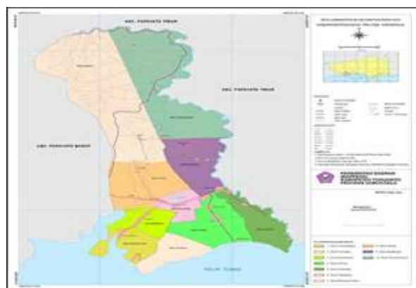
Fig 4. Popayato Subdistrict Maps

The Popayato subdistrict consists of 10 villages and 37 hamlets, with the capital of the subdistrict located in Tahele. In 2023, there was an acreage in Dusun Jati, Kampung Torosiaje Jaya, which has added a Dusun Mangrove as a new Local Environment Satuan (SLS) in the village. In 2022, the population in the Popayato Subdistrict has been 11,014, comprising 5,564 male residents and 5,450 female residents. The ratio between the male and female population in this subdistrict is 1.02. It means that the male population is more than the female population.