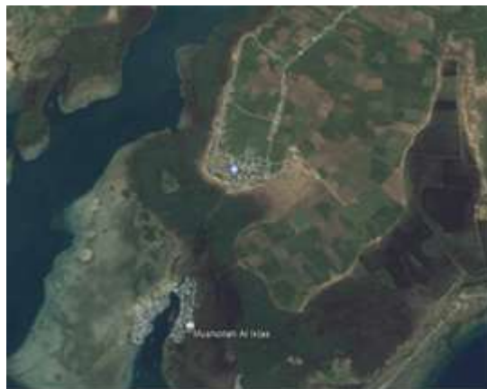
Fig. 2: Research Site at Torosiaje Laut Village

The research site was one of the villages of the Bajo tribes which occupied the Gorontalo region of the village of Torosiaje Laut. It is one of the villages located in the Pohuwato district, Pohuwato, Gorontalo province that has considerable natural resources. The condition of the region on the Gulf Coast of Tomini has a typical characteristic. The village of Torosiaje Laut was scouted from the village of Torosiaje, a settlement of the Bajo tribe.