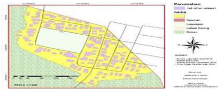
Fig 8: Space Utilization Patterns

In the Torosiaje Village, there is reclaimed land or land that has been filled up and used as a sports field, school buildings and several residents' houses.