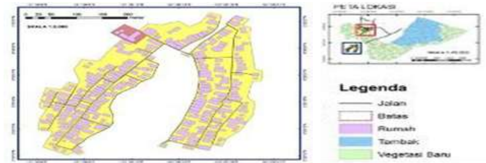
Fig. 7: Space Utilization Patterns

In the Torosiaje village settlement, there is also open space in the form of a field used for sports, social and play facilities. However, the Pohuwato Regency government plans to transform it into an open park.