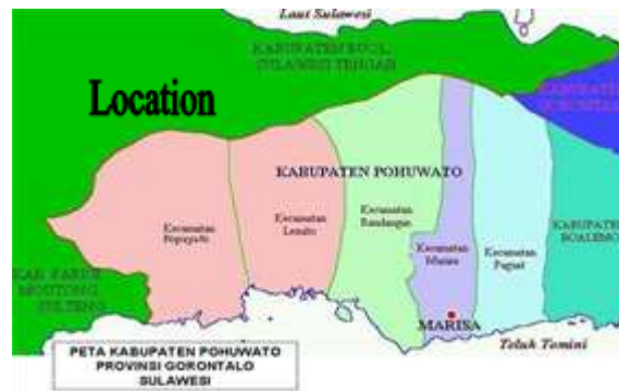
Fig. 3: Pohuwato District Map