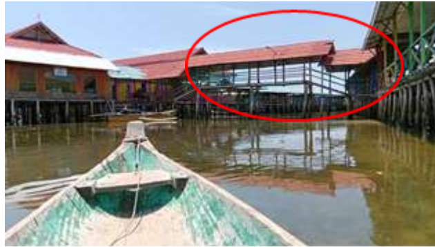
Fig. 6: Bridge Connecting Between Hamlets