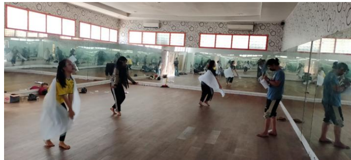
Fig. 5: Cast Rehearsals in Theater Studio

After the dramaturgical concretization stage is carried out, the next stage is stage concretization, namely transferring the play script into a stage form. This stage is an effort to bring the artist's perspective closer to that of the recipient, namely by modifying traditional or existing forms, and modern forms or newly created forms. The play script that has been produced is then rehearsed so that it can be turned into a complete theatrical performance. The rehearsal process is carried out in the theatre studio as seen in the Figure 5. with a rehearsal schedule 3 times a week.