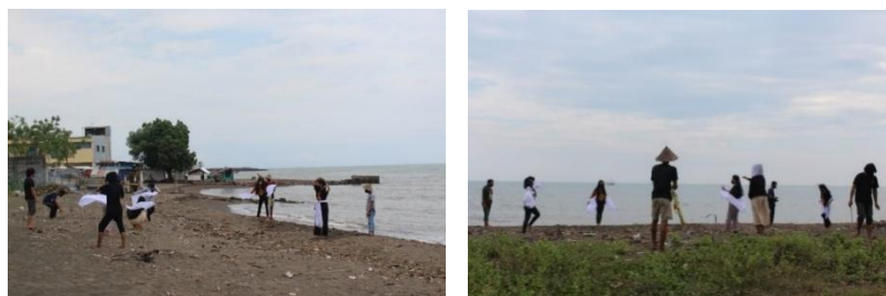
Fig. 4: The Players Are in the Bugis-Makassar Coastal Area

The artistic form in the form of a play script is then adjusted between the researcher's exploration and perspective through dramaturgical concretization. At this stage, material and creative techniques are selected to concretize the elements of the performance, and creativity in the performance also begins to take shape. The traditional form of Kondo Buleng theater performance is maintained as the main concept of the show. Kondo Buleng traditional theater has a form of performing arts with an innocent, funny, spontaneous and improvisational comedy aesthetic using symbols of language, body, movement, expression, props, music and songs (Ramli and Saputra, 2023). The performance uses traditional music, or typical Bugis-Makassar music, namely the harp, flute and Makassar drum. Using regional dialect, namely the Makassar regional language. The performance venue is open in the form of an arena (surrounded by the audience). This arena concept also makes it easier to convey messages about marine waste management in the Bugis-Makassar coastal area.