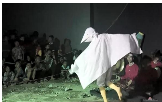
Fig. 2: The character of Kondo Buleng is a Depiction of A White Stork

The research reveals that the elements that Kondo Buleng still maintains as traditional media are in the main characters who serve as the main identity. Etymologically, the word Kondo Buleng comes from the local Bugis-Makassar language. Kondo means stork ( Egretta sp ), while Buleng means white so when combined, Kondo Buleng means white stork. The white stork or Kondo Buleng is the main character and the centre of conflict in the story of the show. The character of Kondo Buleng is played by an actor wearing a plain white cloth covered from the shoulders to the feet. Moreover, a piece of white cloth is also tied around the neck. It is rotated upwards to cover the head until the player's face is completely covered. A white cloth that resembles a stork's beak is wrapped around the face, as shown in the Figure 2.