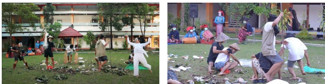
Fig. 7: Kondo Buleng Theater Propaganda Media Performance

After watching the Kondo Buleng theater traditional performance, the Bugis-Makassar coastal communities were then interviewed to see their level of understanding of marine waste management based on the results of the Kondo Buleng theater performance they had witnessed.