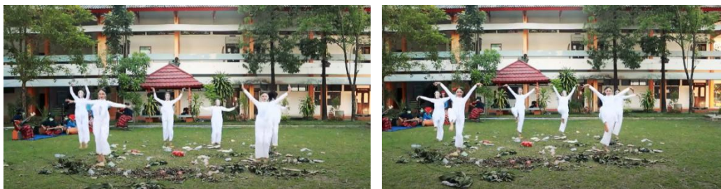
Fig. 6: Kondo Buleng Change Danced by Several Female Dancers

The final stage is receptive concretization to measure the audience's response or reception. The results of the exercises that have been carried out are then shown to the audience, namely the Bugis-Makassar coastal community, as a propaganda medium for marine waste management. To develop the performance, the figure of Kondo Buleng was transformed into a flock of storks looking for fish on the coast as seen in Figure 4. This herd of storks was played by 6 female dancers wearing white costumes. The movements produced were more flexible with the dance compared to the Kondo Buleng performance. The original. The movements of the Kondo Buleng flock are as shown in the Figure 4. Showing a flock of storks in flight and standing on one leg.