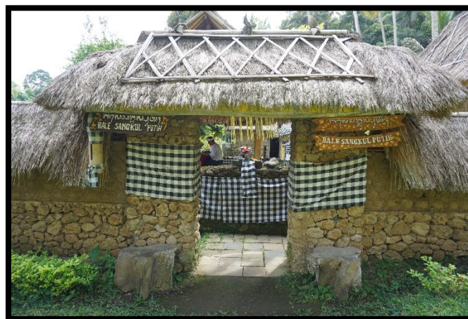
Fig.3: Pustaka Lontar Museum of Dukuh Penaban Traditional Village, Karangasem, Bali