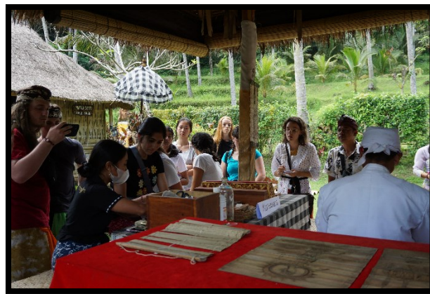
Fig. 5: Museum Pustaka Lontar serves as a Lontar Education Centre

Since its founding, the Pustaka Lontar Museum of Dukuh Penaban in Bali Province, Karangasem Village, and Karangasem Regency has also transformed into a Lontar Education Centre (see Figure 5). In 2019, Dukuh Penaban's residents demonstrated their sincerity and diligence by first placing in the National Pokdarwis for the Mandiri category. The Pustaka Lontar Museum of Dukuh Penaban has alternated between hosting a variety of cultural, artistic, and educational activities, workshops, camping trips, and visits from school children, college students, members of the government, organisations, local communities, archipelago, and international nations. Since then, a great effort has been made to preserve the Balinese lontar effectively. The Pustaka Lontar Museum of Dukuh Penaban traditional village, Karangasem, won the esteemed Indonesia Museum Award 2022 for the Inspiring Museum category on December 20th, 2022.