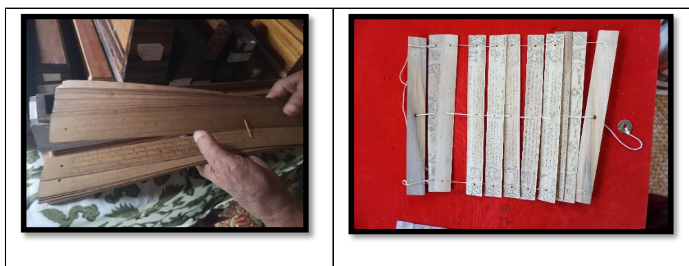
Fig. 1: Balinese Palm-Leaf Manuscript (Indonesian, lontar)

There is occasionally concern about the Balinese people losing the ability to comprehend the quality of life described in the lontar book and apply it to daily life. Throughout history, the Balinese lontar manuscripts have maintained considerable significance, mostly due to its function as a conduit for information transmission, documentation of historical occurrences, and as a means of communication.