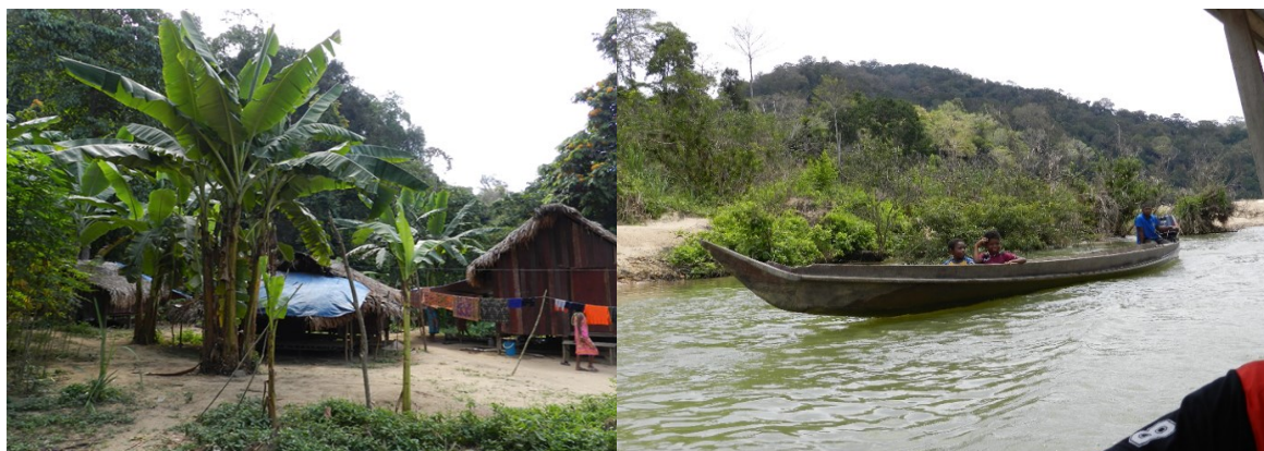
Fig. 1 Orang Asli Batek

The Batek people, especially those who live in Kuala Tahan, are unique quarters of the Orang Asli folks who are rich in culture. They can survive and be recognized by the local or foreign tourists. Their lives still depends on their environment, and naturally form various unique and dynamic knowledge related to it. They thus have a great potential to invent ecotourism products for commercialization. These may involve possessing knowledge, exposure, habits and experiences in the vast forest that they inhabit (Ismail et al., 2023; Ibrahim, 2019, Asmawi et al., 2023). Knowledge they possess related to ecology allows the indigenous people to organize their lives in an orderly and meaningful manner. This knowledge also enables them to exploit resources and valuable elements in the jungle, especially in the usage of flora and fauna as the source of food, economy, housing, medicine and others. They are also very skilled in navigating the intricacies of forests and jungles in the Kuala Tahan Forest Reserve and the National Parks (Fatanah, 2009; Asmawi, 2013 & 2019; Asmawi et al., 2023).