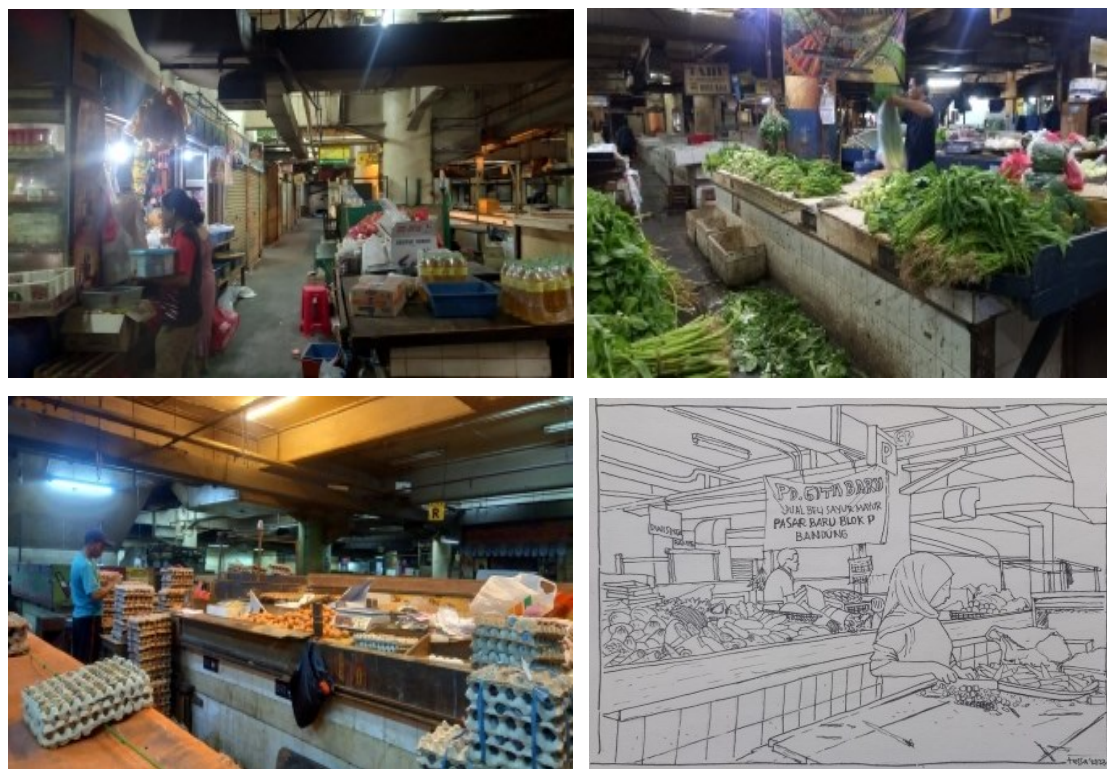
Fig. 10: The Sources of Typical Wet Market Aroma within Pasar Baru Bandung Building: Herbs, Vegetables, Eggs

dates and sweets because the floor is filled with sellers of Middle Eastern food, such as dates. Meanwhile, on the other floors, it smells more like fabrics that have just come out of the factory because they sell lots of fabrics and ready-made clothes. The sense of touch is also included in this area because sellers, buyers, or visitors often touch something that attracts their attention, such as the texture of fabric or clothing material. It even involves the sense of taste because, for the food part, you are allowed to sample the food you intend to buy.