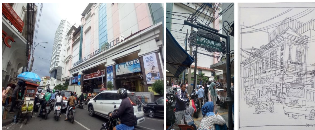
Fig. 7: The Crowd Around Pasar Baru Bandung as a Physical Setting of Pasar Baru Bandung