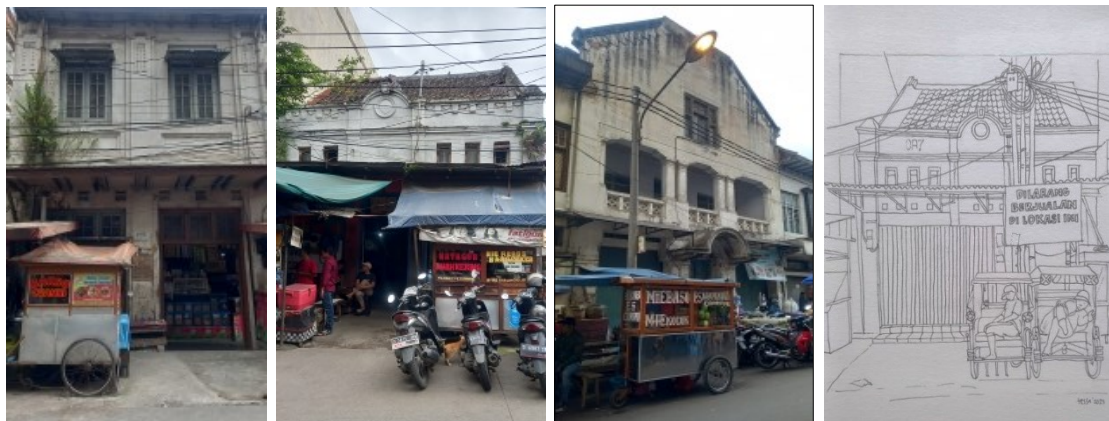
Fig. 8: Various Activities as a Lifeline for Empty Old Buildings around Pasar Baru

The above comment is from an informant who was shopping around the market regarding the features of Pasar Baru, which is preferable if it is crowded, with lots of things to observe and enjoy, since if it is quiet, it is like a dead region. Many activities bring the Pasar Baru area to life, not just for the people but also for the things and heritage buildings that surround it. Previously, it was explained that many old European or Chinese-style buildings are damaged, poorly maintained, and even empty, and have lost their souls, but are still “visible” because they are given a heartbeat by activities outside the building, such as street vendors, motorbike parking facilities, or a place where pedicab ( becak ) drivers wait for passengers.