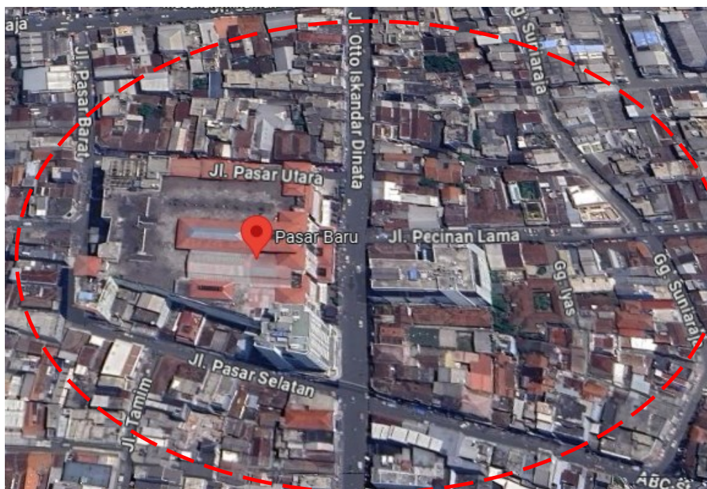
Fig. 3: The Pasar Baru Bandung within Chinatown ( Pecinan ) District

Pasar Baru Bandung was originally located in the area called Kapatihan, but was relocated to Chinatown ( Pecinan ) when it burned down during the Munada Riots in 1842. Since then, traders have moved around without permanent structures. Pasar Baru Bandung is now located in the Pecinan district, which was developed under Dutch colonial rule (Raap, 2015) and the market building was constructed in 1906 and still stands today with renovation on Jalan Otto Iskandar Dinata, also known as Otista Street (Fig 3). Pasar Baru Bandung, as a research case study, is an iconic district of the city since it still has old yet beautiful structures with historical stories. The structure is designed in a Chinese and Dutch colonial style. Numerous old buildings around the market are not properly preserved and some have suffered more contemporary alterations owing to renovation, resulting in the loss of their cultural and historical identities. Similarly, the market structure has experienced several adjustments.