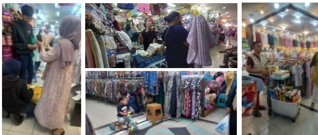
Fig. 9: The Source of Typical Sounds within Pasar Baru Bandung Building.

Inside the building, you can frequently hear the typical call of traders looking for consumers, adding to the spirit of Pasar Baru Bandung " Lihat-lihat dulu teteh, aa.. di sini murah " (read: look first because it's cheap here). Then, voices were heard in Sundanese as the local language from food traders walking around Pasar Baru offering their goods to the traders – " hayu atuh, makan siangnya, cemilannya, minumannya teteh.. aa " (read: Let's buy food, snacks, drinks, brother), or the sound of the happy screams of the merchant's children playing. This sound has become everyday life, food sellers and buyers are so familiar that laughter can be heard as they joke with each other.