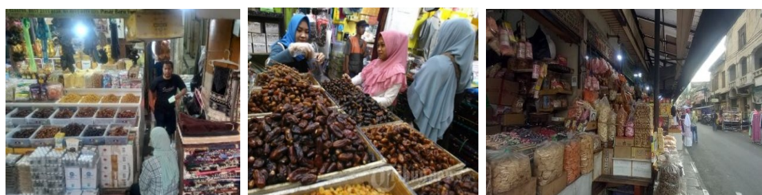
Fig. 11: The Sources of Traditional Aroma - Dates, Sweets and Bandung Traditional Chips in Pasar Baru Bandung – The Activation of Sensory of Taste and Touch.