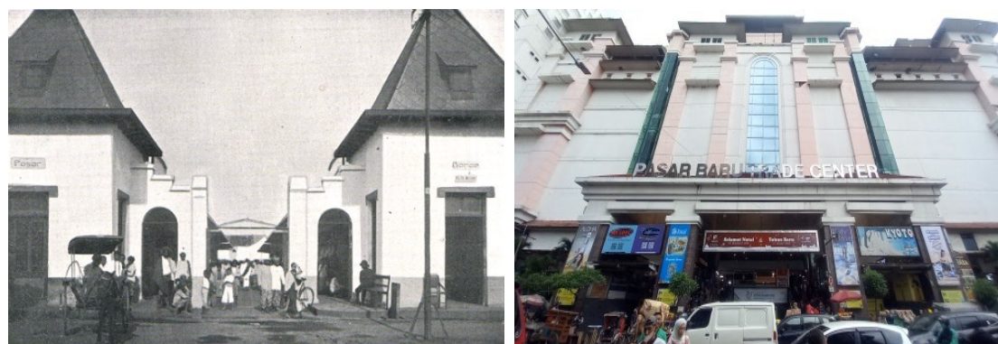
Fig. 1: The Façade of the Pasar Baru Building from the year of 1950 (left) & the year of 2022 (right).

The market layout features rows of shops in the front, and side, and stalls for traders in the rear area. In 1926, this building was expanded with the construction of a permanent market complex that was larger and more organized. In fact, it is the pride of the city residents because it won the title of the cleanest, neatest, and most orderly market in the Dutch East Indies in 1935. The first renovation was carried out in the 1970s, making the market building into a modern building and this modern impression persists today because the residents focus on the form of increasingly high-rise buildings that are equipped with other modern facilities, such as escalators and lifts. However, the traditional market concept is still maintained, inside and outside the building. The Dutch and Chinese-style vernacular architecture around the market building further supports the features of Pasar Baru Bandung. This market is not only well-known in Bandung but also in the surrounding countries such as Malaysia. Therefore, it has become a symbol of the economy of Bandung. These factors justify why Pasar Baru Bandung is the research case study.