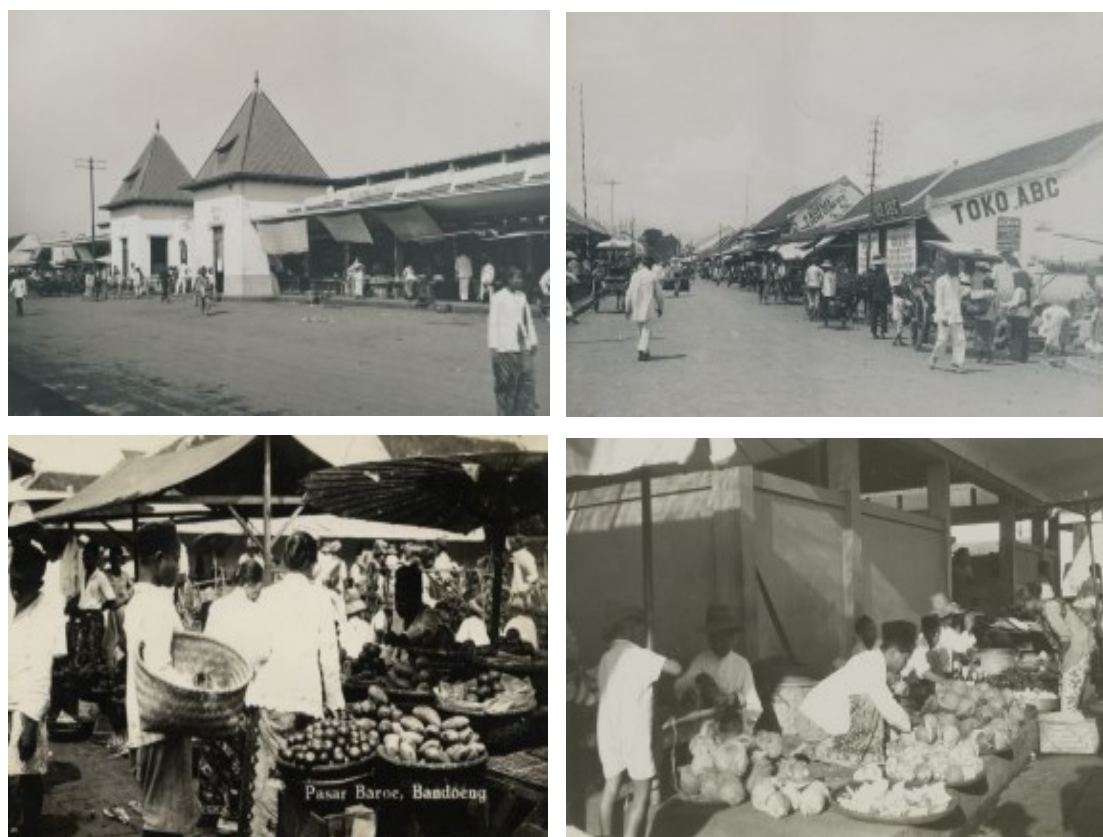
Fig. 4: The Pasar Baru Building Condition in 1920 (left above) and the surroundings in 1930's.

The market building has been originally built in a European- Indische style, as seen by various old images with Dutch titles in the KITLV-Leiden collection - De Pasar Baroe, het centrum van de Chinese handelswijk te Bandoeng (shelfmark KITLV 11829), De "oude" Pasar Baroe, het centrum van de Chinese handelswijk te Bandoeng (shelfmark KITLV 11827), Pasar Baroe, Bandung (shelfmark KITLV 1400263), and De pasar baroe in Bandoeng (shelfmark KITLV 25104) portrays the market's situation in the 1920s and 1930s as the center of Bandung's Chinese commercial district, which still tended to be calm and orderly at the front of the market building, but inside it was still lively with buying and selling activities.