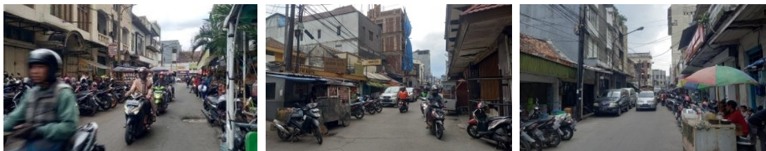
Fig. 6: Street ( jalan ) Situation that Surrounds Pasar Baru Building – Jalan Pasar Utara (left), Jalan Pasar Barat (middle), Jalan Pasar Selatan (right)