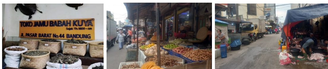
Fig. 12: The Source of Distinctive Aroma at Pasar Barat Street, Pasar Baru. 8 AM-5 PM the Aroma of Herbs & Spices (left-middle), 5 PM-onwards the Aroma of Poultry Source: Author, 2023 & https://bandungraya.inews.id/ , 2023 (left)