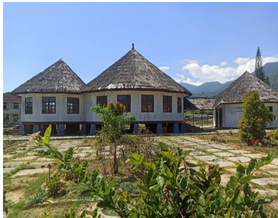
Fig. 4: Contemporary Adaptations to Traditional Houses

It is undeniable that the factors that play a role in this change come from within the community, the evolution of peoples's lifestyles, and also from external influences such as national policies, the boom in the tourism sector, vibrations from the effects of globalization, and various other dynamics that are no less interesting.