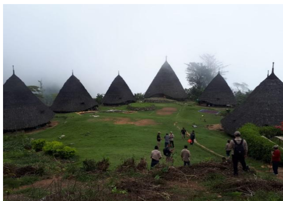
Fig. 2: Mbaru gendang traditional house architecture