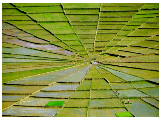
Fig. 3: Lingko land architecture

Mbaru gendang architecture has a distinctive shape as a result of the evolution of earlier customs that reflect the characteristics and identities of the local population. Mbaru (house) is a shelter from hot and rainy weather, while lingko (customary gardens) serves as a source of livelihood. Mbaru gendang is the cultural center of the Manggarai peoples and is located in the center of the village. It acts as a central point in Manggarai. In the mbaru gendang , all aspects of the culture and local wisdom of the Manggarai peoples are reflected. This involves arts such as dance, performance and games, as well as values in shared life such as collaboration, gotong royong, and deliberation. In addition, various aspects of religious life are also expressed through rituals, traditional ceremonies, and religious practices, with the aim of caring for and preserving harmonious relationships with others, Nature and the Creator (Adon, 2022).