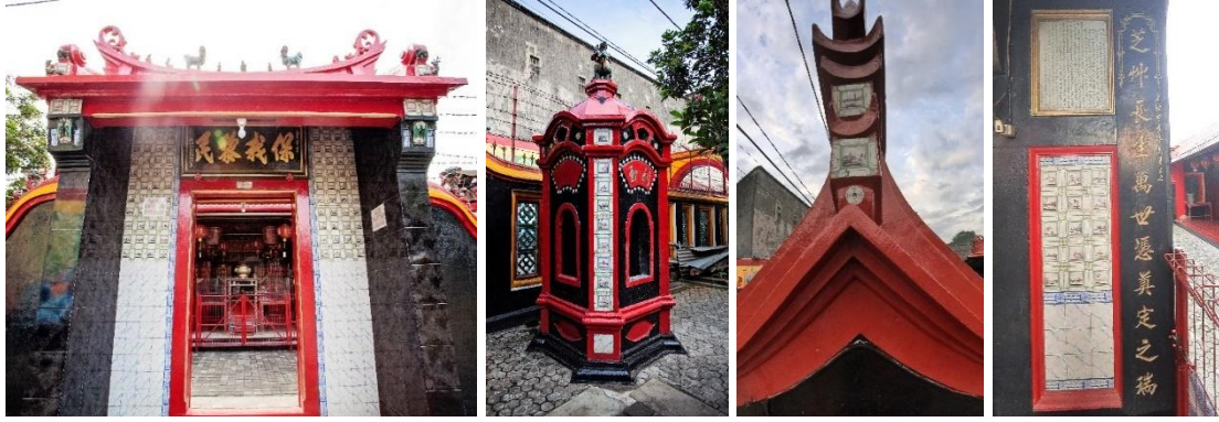
Fig. 8: Ceramics on the entrance walls, kilns, roofs, and walls in the temple