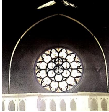
Fig. 6: Rose Window in Jakarta Cathedral Church in Neo-Gothic (1852)

In Indonesia, Neo-Gothic architecture in catholic church buildings came after the ethical politics implemented by the Dutch colonial government at the end of the 19th century. As an integral element of Gothic architecture, church buildings built in the Neo-Gothic style generally have rose windows. But in its development, the rose window element is applied not only to Neo-Gothic churches but also to new church designs in Indonesia today.