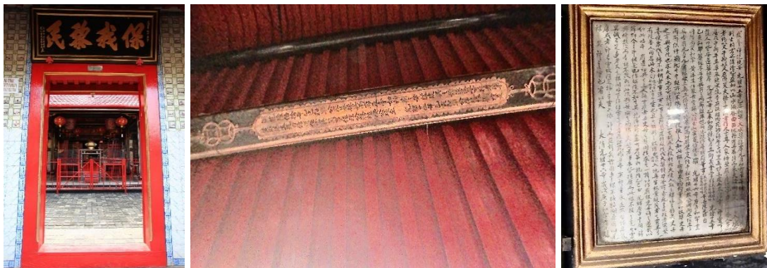
Fig. 16: Chinese calligraphy inscriptions at the Dharma Rakhita Temple

In general, the architectural designs of Chinese temples have decorations that are popular in their interiors, namely in the form of Chinese alphabets or kanji letters written as Chinese calligraphy (Primayudha, Purnomo and Setiyati, 2014). The interior decoration with a Chinese cultural theme is located at the entrance gate, front and inside the main building, and roof supports. The calligraphy on the main door is a notice board for the temple, representing respect for the space traversed (Fajri, Syarif, and Hildayanti, 2020).