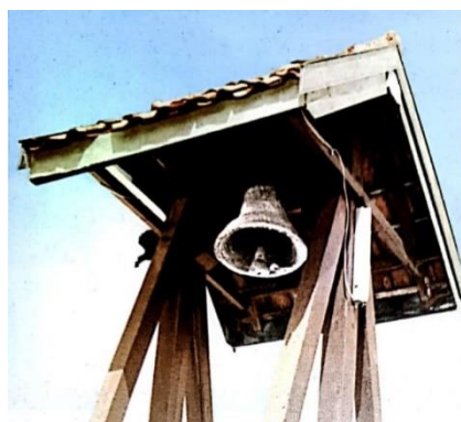
Fig. 11: Tower with bells at the oldest church, the Portuguese Church 1695 (now called the Zion Church) Jakarta