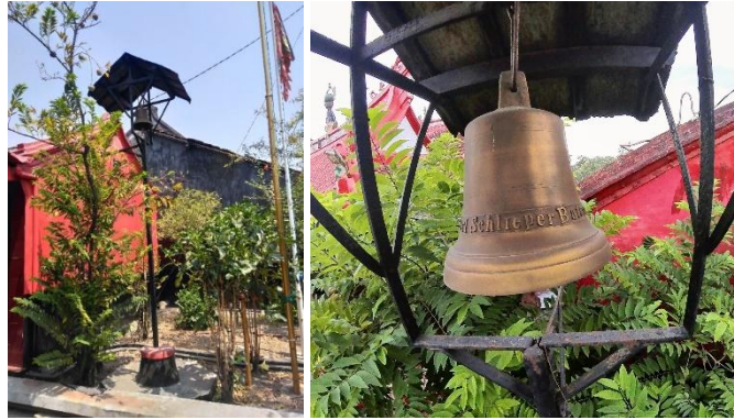
Fig. 10: Bells bearing Carl Schlieper Batavia