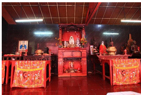
Fig. 14: Other deities in the Dharma Rakhita temple

The diversity of religions is very visible in this temple. Apart from the Hok Tek Ceng Sin god as the main deity, on the right side of the temple, there are several other gods, such as the Buddhist statue of the Goddess Kwan Im, a Hindu statue, a statue of the Chinese god of war Kwan Kong, an altar with a photo of Confucius. These deities were also taken care of at this temple because during the Suharto era because the temple did not get a permit, the prayer places were used as places of worship for Buddhism; there were also statues that the previous owner deposited because he had converted to Christianity. There is no objection to the placement of these gods, even though they have different beliefs.