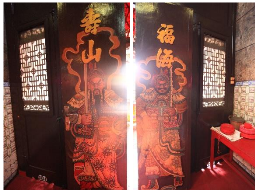
Fig. 18: The main door has a picture of the Sky Palace officials

The distinctive features that stand out at this temple are found on the leaves of the main entrance, such as the characteristic of the main door of the Chinese temple, where there are paintings of ancient warlords called Men-Shen, which means the powerful God at the door. These are historical figures named Qin Shu Bao (Cin Siak Poo) and Yu Chi-gong (Oet Tie Kiong) commanders during the Tang dynasty (Kustedja, Sudikno and Salura, 2013).