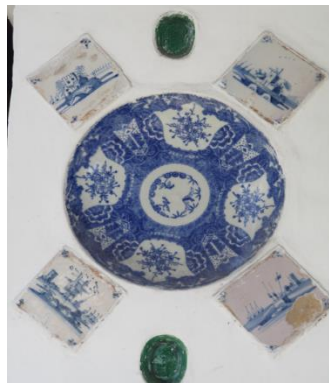
Fig. 9: Dutch ornate ceramics on the tomb of Sunan Gunung Jati (1448-1569)