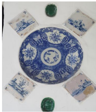
Fig. 9: Dutch ornate ceramics on the tomb of Sunan Gunung Jati (1448-1569)

The Chinese presence in Cirebon has been earlier than the Dutch, namely in the 1400s when Princess Ong Tien came to Cirebon, only a few kilometers from Jamblang. In ancient times, it has been a port city bustling with Dutch and Chinese people. Ceramic relics with European ornaments can also be found in Gunung Jati's tomb (1448-1569), also in the Panjunan Red Mosque (1480), and Kanoman Palace Cirebon (1678) (Wibisono, 2004).