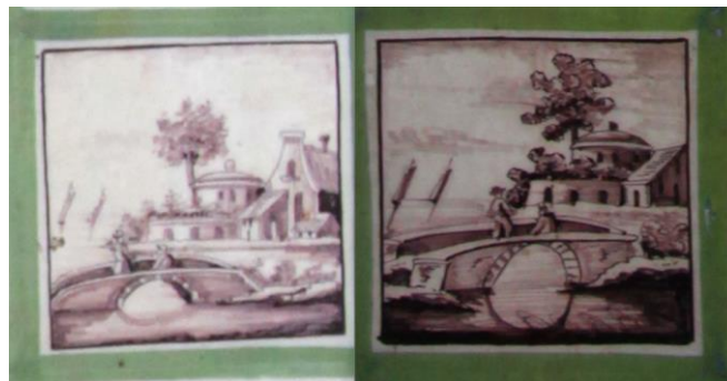
Fig. 7: Ceramics with European image motifs in the temple

According to observations, ceramics exist on the edges of the roof as part of the ornament, on the roof, on the entrance gate, on the kiln, and on the inner and outer walls of the temple; ceramics depict Europe. Dutch/European ornamented ceramics at the Dharma Rakhita Temple because the Dutch had been in Cirebon for a long time. This European ceramic measures 15 x 15 cm.