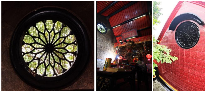
Fig. 5: Rosetta window in Dharma Rakhita Temple

The Eclectic style in the first Dharma Rakhita Temple is European culture which is visible in the placement of the Rose Window, which, as an element of Gothic Architecture, represents Gothic aesthetics. The rose window is the most striking Gothic architectural element on the facade of a Catholic church. This element has been consistently applied in France, developed in Italy, and spread to Europe. The rose window strengthens and gathers the aesthetic energy of all the other facade elements into a single focal point. It is a window that acts as a large visual center of gravity (Estika et al. , 2023).