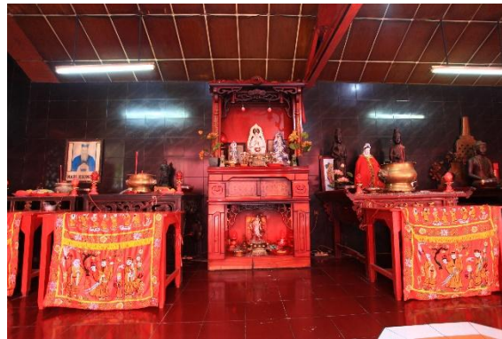
Fig. 14: Other deities in the Dharma Rakhita temple

The diversity of religions is very visible in this temple. Apart from the Hok Tek Ceng Sin god as the main deity, on the right side of the temple, there are several other gods, such as the Buddhist statue of the Goddess Kwan Im, a Hindu statue, a statue of the Chinese god of war Kwan Kong, an altar with a photo of Confucius. These deities were also taken care of at this temple because during the Suharto era because the temple did not get a permit, the prayer places were used as places of worship for Buddhism; there were also statues that the previous owner deposited because he had converted to Christianity. There is no objection to the placement of these gods, even though they have different beliefs.