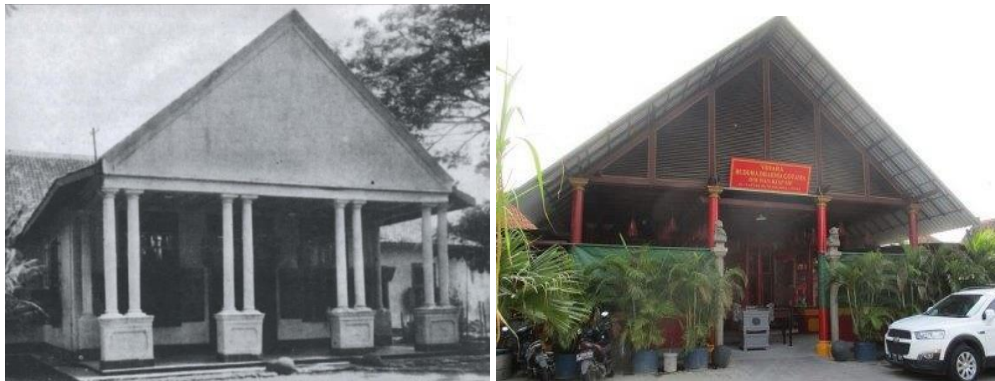
Fig. 2: Goenoeng Sari House to become Sentiong Wan Kiap Sie 完却寺 Temple