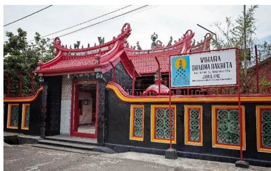
Fig. 4: Dharma Rakhita Temple with an eclectic building style

Dharma Rakhita Temple, also called Hok Tek Ceng Sin Temple, is one of the landmarks which is a significant marker of the existence of the Chinese community in Jamblang. It faces the Jamblang River facing the field to the East. There is no record of the exact year this temple was founded. Based on the stories in the community, this temple is believed to have the same roof ridge wood as the wood used for the construction of the Sang Cipta Rasa Mosque Jl Kasepuhan No.43 Lemahwungkuk, Cirebon City, which was built in the 1480s.