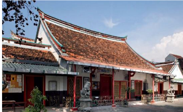
Fig. 1: Tjioe Family Residence became St. Maria De Fatima Catholic Church Jakarta, Indonesia