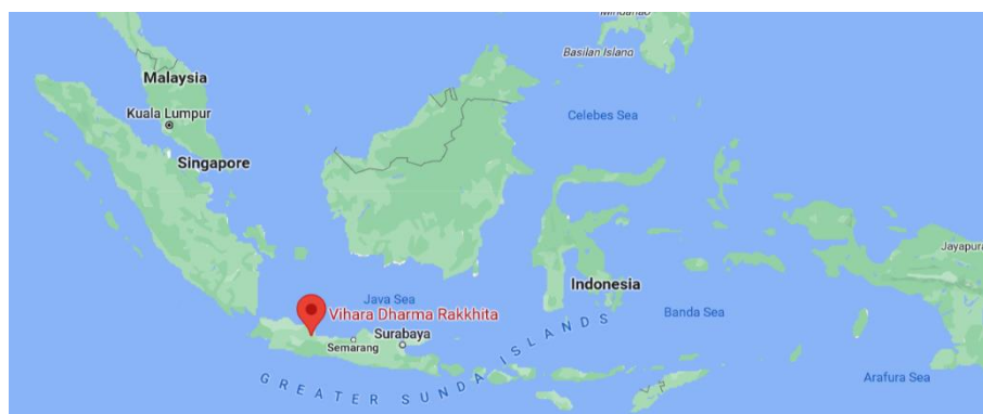
Fig. 3: Location of Dharma Rakhita Temple on Java Island, Indonesia