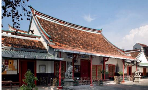
Fig. 1: Tjioe Family Residence became St. Maria De Fatima Catholic Church Jakarta, Indonesia