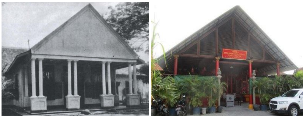
Fig. 2: Goenoeng Sari House to become Sentiong Wan Kiap Sie 完却寺 Temple