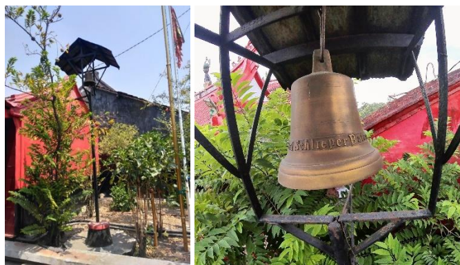
Fig. 10: Bells bearing Carl Schlieper Batavia