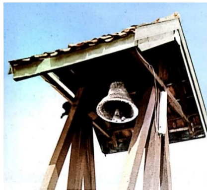
Fig. 11: Tower with bells at the oldest church, the Portuguese Church 1695 (now called the Zion Church) Jakarta