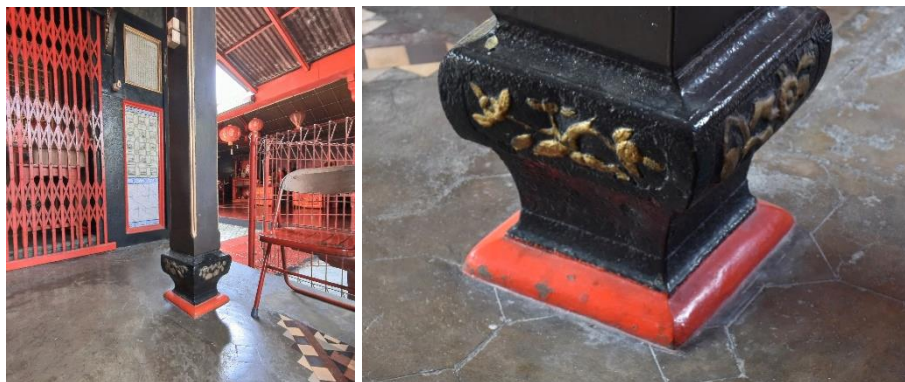
Fig. 13: The base of the column of the temple is like the base of the column which is usually found in Javanese buildings

The base of the column of this temple shows distinctive ornamentation resembling pedestals in Javanese houses. The base of this column is black, with gold carved ornaments on the top. Understanding the Javanese house is inseparable from an ancient building called punden terraces (graves of ancestors), a terraced structure centered the higher, the smaller. This structure consists of 3 parts, namely the upper structure in the form of a towering roof like a mountain. The middle structure consists of 4 pillars made of rectangular wood. The lower structure in the form of a base or base of columns in the form of stone, which distributes the weight of the wooden poles to the ground in Javanese houses, is called umpak . The Javanese house represents the universe which consists of the upper world where the gods live, the middle world where humans live, and the underworld as the ground/earth (Djono, Utomo, and Subiyantoro, 2012). The traditional Javanese house has influenced many other houses, including the ash house (built by the clan family and used as a prayer house and residence to honor Chinese ethnic ancestors). Because of this, the structure of the ash house has many similarities with the Javanese traditional house in many ways.