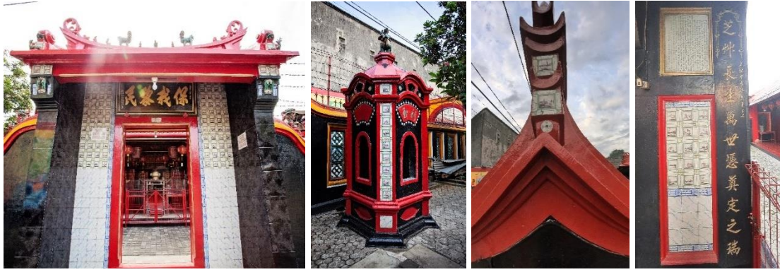
Fig. 8: Ceramics on the entrance walls, kilns, roofs, and walls in the temple