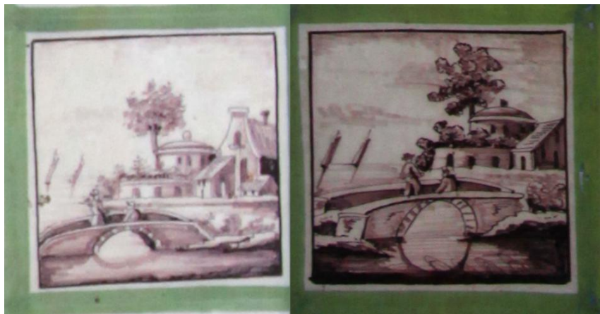
Fig. 7: Ceramics with European image motifs in the temple

According to observations, ceramics exist on the edges of the roof as part of the ornament, on the roof, on the entrance gate, on the kiln, and on the inner and outer walls of the temple; ceramics depict Europe. Dutch/European ornamented ceramics at the Dharma Rakhita Temple because the Dutch had been in Cirebon for a long time. This European ceramic measures 15 x 15 cm.