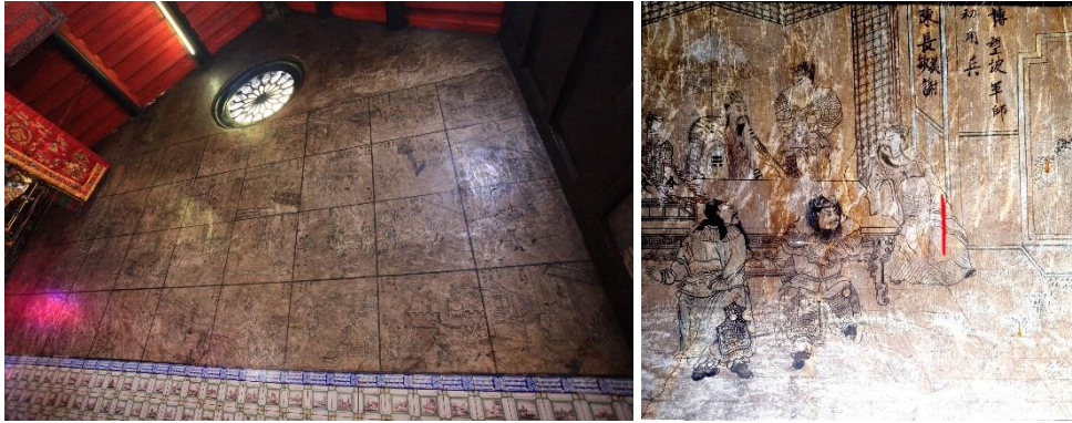
Fig. 17: Wall depicting classical Chinese stories