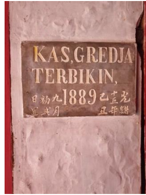
Fig. 12: Carving of ancient Indonesian writing in the temple room