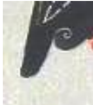
Fig. 3: Visual Representation of the Wali Miring nose of the Wayang Arjuna figures

The second dimension explains the figure of Arjuna in the Pancasila student profile, which states that Indonesian students maintain their noble culture, locality, and identity while remaining open-minded in interacting with the other cultures, fostering a sense of mutual respect and the possibility of forming a new positive culture that does not conflict with the nation's noble culture. This dimension is made up of three components: recognizing and respecting culture, intercultural communication skills in connecting with others, and reflection and responsibility for the diverse experience (Astuti, 2014).