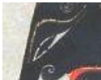
Fig. 2: Visual representation of the Liyepan eye on wayang Arjuna character