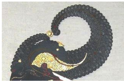
Fig. 6: Visual Representation of Wayang Arjuna's Gelung Minangkara

In the Pancasila student profile, the fifth dimension defines the Arjuna figure. Students who can objectively digest both qualitative and quantitative information, develop linkages between varied information, analyze information, assess, and then draw conclusions are referred to as critical thinkers. This dimension is made up of four elements: collecting and processing information and ideas, analyzing and assessing reasoning, reflecting on thoughts and mental processes, and making decisions.