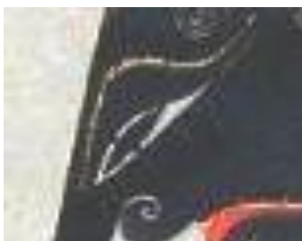
Fig. 2: Visual representation of the Liyepan eye on wayang Arjuna character