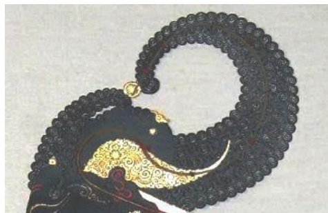
Fig. 6: Visual Representation of Wayang Arjuna's Gelung Minangkara

In the Pancasila student profile, the fifth dimension defines the Arjuna figure. Students who can objectively digest both qualitative and quantitative information, develop linkages between varied information, analyze information, assess, and then draw conclusions are referred to as critical thinkers. This dimension is made up of four elements: collecting and processing information and ideas, analyzing and assessing reasoning, reflecting on thoughts and mental processes, and making decisions.