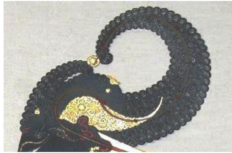
Fig. 7: Visual Representation of Wayang Arjuna Figure's Gelung Minangkara

The sixth dimension that exists in the Arjuna figure also related to the Pancasila student profile. The creative dimension mentioned to in the Pancasila Student Profile refers to a student who can change and make something original, meaningful, valuable, and impactful. This dimension consists of two components: producing creative ideas and original works and actions.