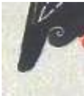
Fig. 3: Visual Representation of the Wali Miring nose of the Wayang Arjuna figures

The second dimension explains the figure of Arjuna in the Pancasila student profile, which states that Indonesian students maintain their noble culture, locality, and identity while remaining open-minded in interacting with the other cultures, fostering a sense of mutual respect and the possibility of forming a new positive culture that does not conflict with the nation's noble culture. This dimension is made up of three components: recognizing and respecting culture, intercultural communication skills in connecting with others, and reflection and responsibility for the diverse experience (Astuti, 2014).