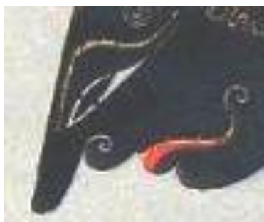
Fig. 5: Visual Representation of the Wayang Arjuna's Wali Miring Nose

The fourth dimension explains the figure of Arjuna in the Pancasila student profile, which implies that the Indonesian students are accountable for both the process and the outcomes of their learning. This dimension is comprised of three components: self-awareness, situation awareness, and self-regulation. The shape of the Wali Miring nose reveals independent meanings. In Javanese, wali refers to a particular small knife used to cut the layers of the cow's skin before carving it to form wayang kulit. Wali , which means knife, represents the sharpness of the sense of scent. Sharpness also implies sensitivity of the senses. The sensitivity that