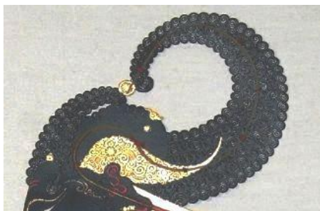
Fig. 7: Visual Representation of Wayang Arjuna Figure's Gelung Minangkara

The sixth dimension that exists in the Arjuna figure also related to the Pancasila student profile. The creative dimension mentioned to in the Pancasila Student Profile refers to a student who can change and make something original, meaningful, valuable, and impactful. This dimension consists of two components: producing creative ideas and original works and actions.