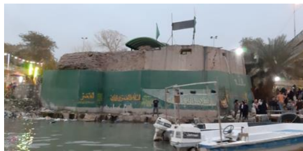
Fig. 8: River elevation of the shrine.