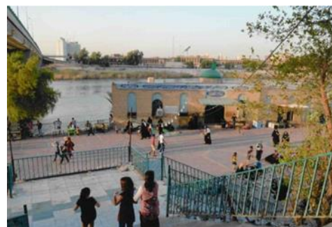
Fig. 6: Topography of site