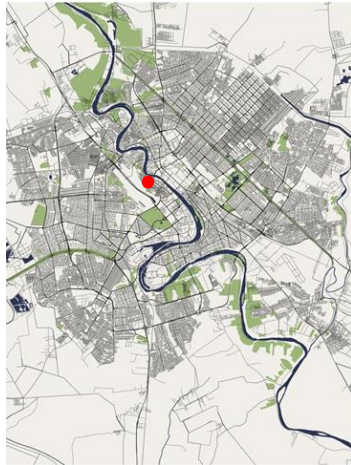
Fig. 1: Plan of Baghdad City today, indicating the location of the Khidr Elias District