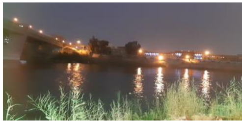
Fig. 9: The bank of Tigris River as it appears from Khidr Elias location