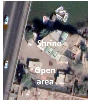
Fig. 4: Shrine directly adjacent to the river, while the open area is in front of the entrance