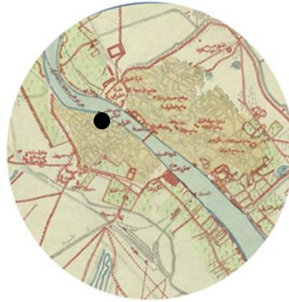
Fig. 2: Plan of Baghdad returns to the beginning of the 20 th century: the historic traditional fabric and the existence of the Khidr Elias area and shrine.