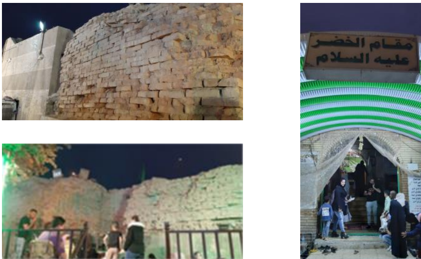
Fig. 7: The poor constructional situation of the shrine as it appears in the side elevations, as well as the poor and temporal additions to the entrance.