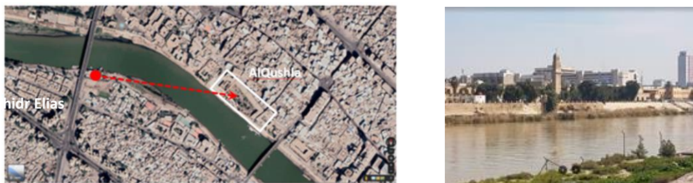
Fig. 14: The space of Al- Qishla is a big open space across the river, defined by its surrounding mass, and its' monumental historical clock. The connection between the two places of Khidr Elias and Al-Qishla is highly recommended to revive the space of Al-Qishla and to start a series of revived historical spaces.