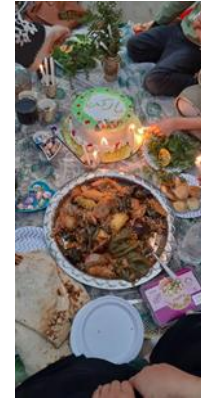
Fig. 12: Traditional tray and food in the celebration

Source: Authors (On the day of Zakkariyya /6 March 2022)