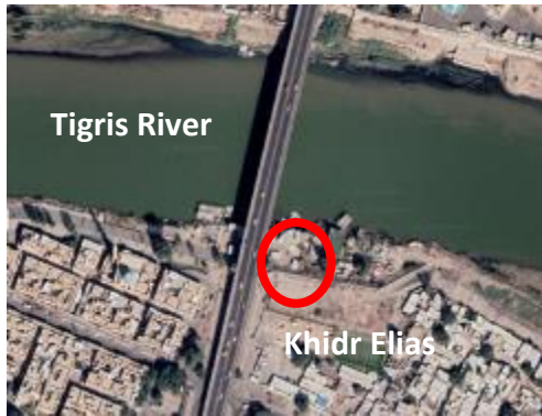
Fig. 3: Location of Khidr Elias District on Tigris River.