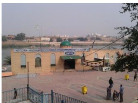
Fig. 5: Shrine and open area in a regular day