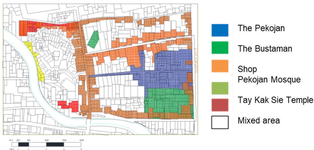
Fig. 1: Figure-Ground Research Area of Semarang

Similarly, the Bustaman village has existed since the 18 th century and has become one of the oldest villages in the city of Semarang. Bustaman Village is better known for being the culinary center of processed goat meat.