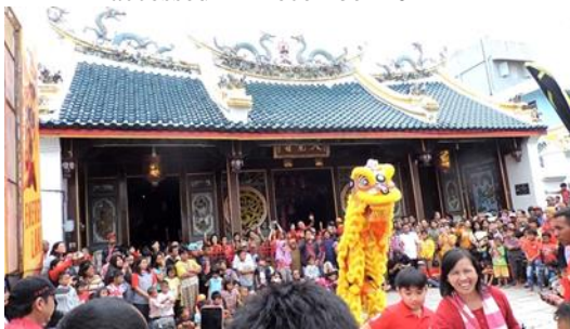
Image Source: Oke News.com (18 January 2020) accessed 12 December 2022