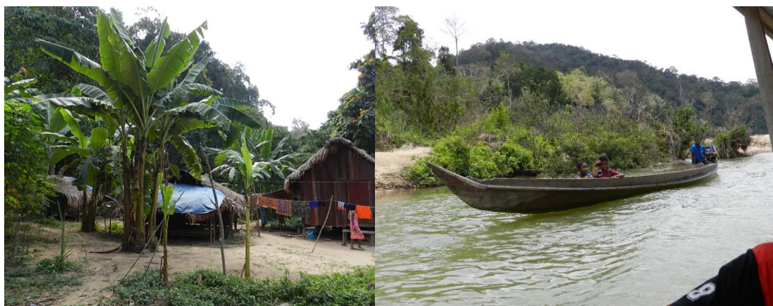
Fig. 1 Orang Asli Batek

The Batek people, especially those who live in Kuala Tahan, are unique quarters of the Orang Asli folks who are rich in culture. They can survive and be recognized by the local or foreign tourists. Their lives still depends on their environment, and naturally form various unique and dynamic knowledge related to it. They thus have a great potential to invent ecotourism products for commercialization. These may involve possessing knowledge, exposure, habits and experiences in the vast forest that they inhabit (Ismail et al., 2023; Ibrahim, 2019, Asmawi et al., 2023). Knowledge they possess related to ecology allows the indigenous people to organize their lives in an orderly and meaningful manner. This knowledge also enables them to exploit resources and valuable elements in the jungle, especially in the usage of flora and fauna as the source of food, economy, housing, medicine and others. They are also very skilled in navigating the intricacies of forests and jungles in the Kuala Tahan Forest Reserve and the National Parks (Fatanah, 2009; Asmawi, 2013 & 2019; Asmawi et al., 2023).