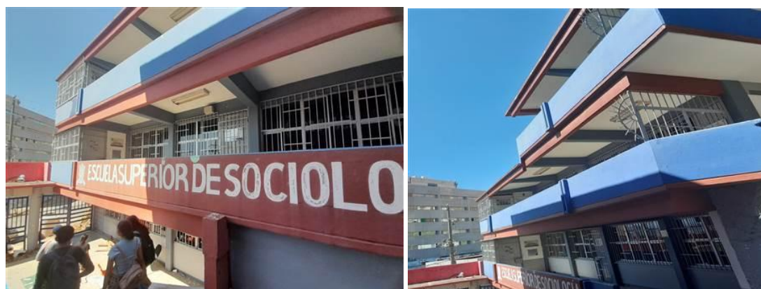
Fig. 3: The School of Sociology

In the school year 2023, it had a student enrollment of 193 students, including 84 men and 109 women. The first intake for this period recorded 53 students, including 21 men and 32 women, and the re-entry was a total of 140, including 63 men and 77 women. There are 18 teachers of whom, 17 are men and one woman, although there are two women. There is a single four-story building where administrative and teaching functions are carried out.