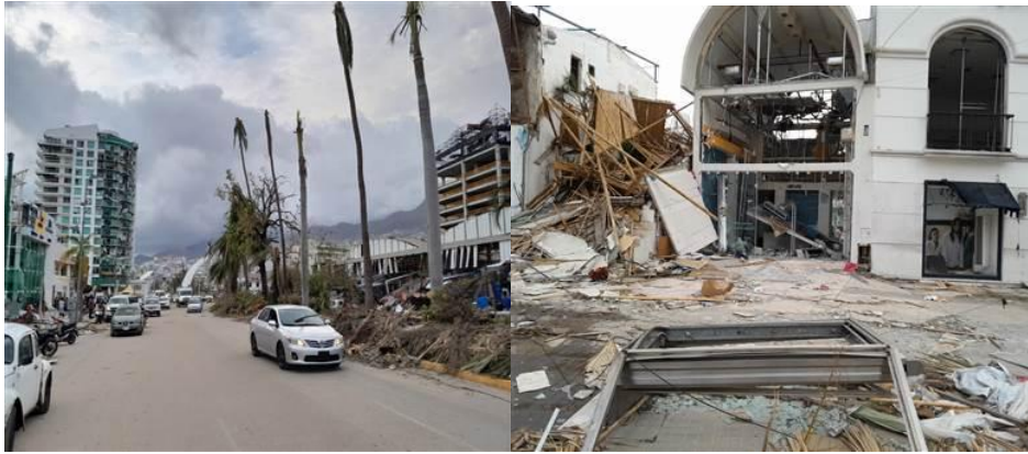
Fig. 5: Acapulco, devastation after the hurricane.