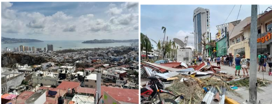
Fig. 4: Acapulco, devastation after the hurricane.

Hurricane Otis, classified as a category 5, struck the City and Port of Acapulco, Guerrero, Mexico, on October 24 and 25, 2023. Despite some government institutions stating that it made landfall in the city in the early minutes of October 25, its intense winds and rains were felt beforehand. Official information on the intensity of the meteorological phenomenon was limited (Figs. 4 & 5).