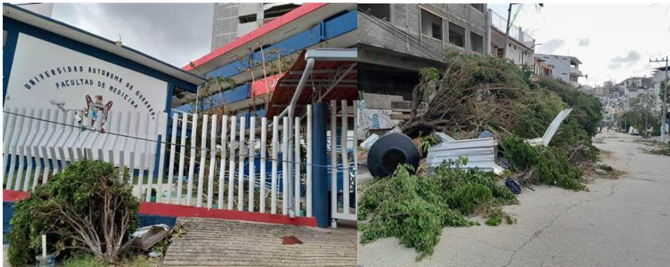
Fig. 6: Impacts of the Hurricane on the University, Faculty of Medicine, UAGro, Acapulco.

The authorities of the School of Sociology officially received information from the authorities of the Autonomous University of Guerrero at noon on October 24, regarding the order to suspend classes due to the approaching hurricane. Based on this information, the authorities of the School of Sociology announced on the Facebook page that classes were suspended for the afternoon classes.