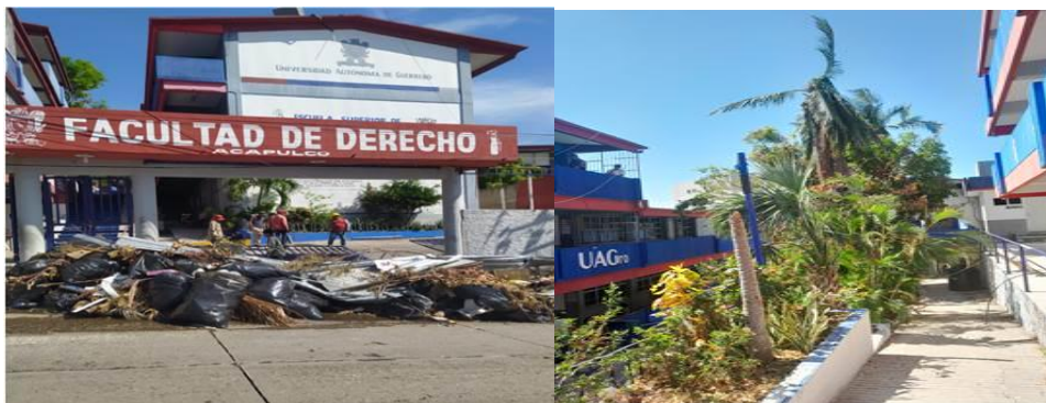
Fig. 7: Impacts of the Hurricane on the University, Faculty of Law, UAGro, Acapulco.