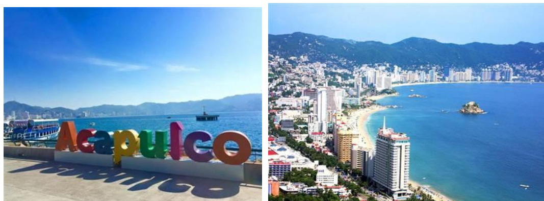
Fig. 2: The image of Acapulco at risk.