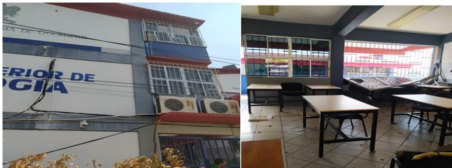
Fig. 9: The Impact of the Hurricane on the University, School of Sociology, UAGro, Acapulco.