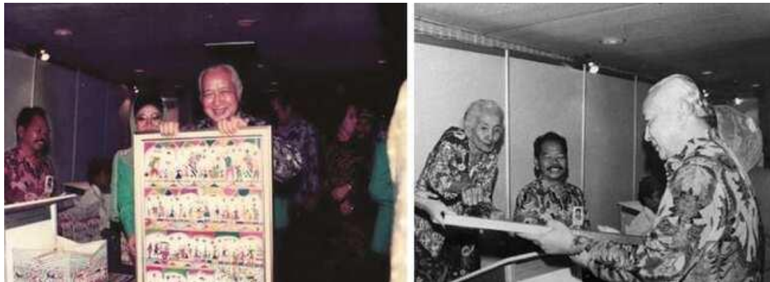
Fig 3: Masmundari with the 2nd President of Indonesia, Soeharto.

"Artifacts of the past are important and urgent to know their meaning, before they are completely lost or transformed into other shapes. The paintings that decorate Damar Kurung need to be known as early as possible, before this traditional art changes over time without knowing its original meaning."