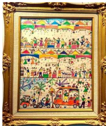
Fig. 9: Damar Kurung in the form of a Two-Dimensional Painting

The third phase involves paintings created by Masmundari during the years 1999 to 2000. In terms of techniques and methods, it continues to employ the same traditional approaches. The materials utilized include drawing paper or larger canvases, allowing for more varied scenes in each sequence and enabling the depiction of a greater number of events. Coloring is executed using dyes that were prevalent during that period, such as markers or paint (Fig. 9).