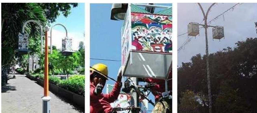
Fig. 10: Documentation of Damar Kurung in Gresik Regency Public Spaces