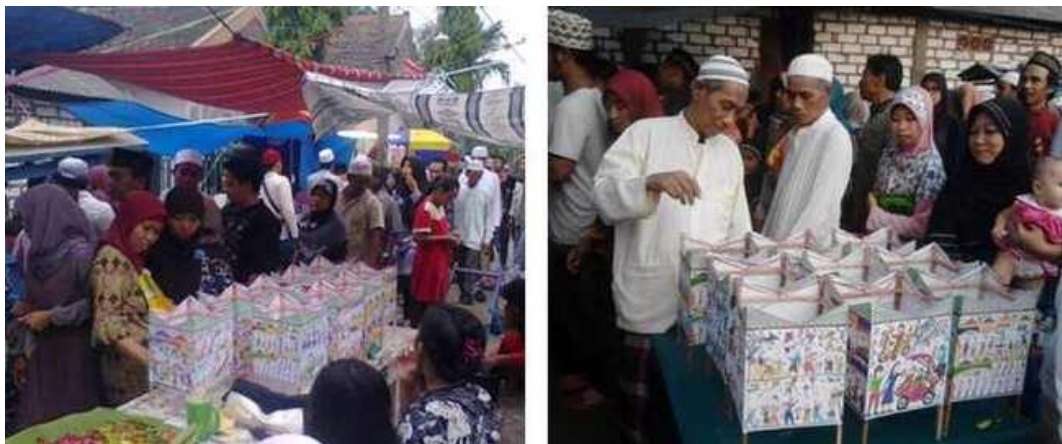
Fig 4: The atmosphere of Damar Kurung sales in the Padusan tradition