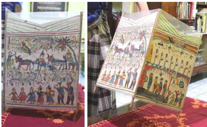
Fig. 7: Damar Kurung from Oiled Paper with An Oily Wick

Throughout its evolution, Damar Kurung underwent several transformations in techniques, methods, and materials to align with contemporary trends. In its initial phase, during the period of paper lanterns (1600-1970s), the technical approach still adhered to traditional painting methods characterized by symbolism and stylization (Fig. 6). The material of choice was waste paper derived from cassava, and the coloring process involved the use of food coloring in traditional hues, including red, yellow, blue, black, and white. The illumination was provided by candles (Fig. 7).