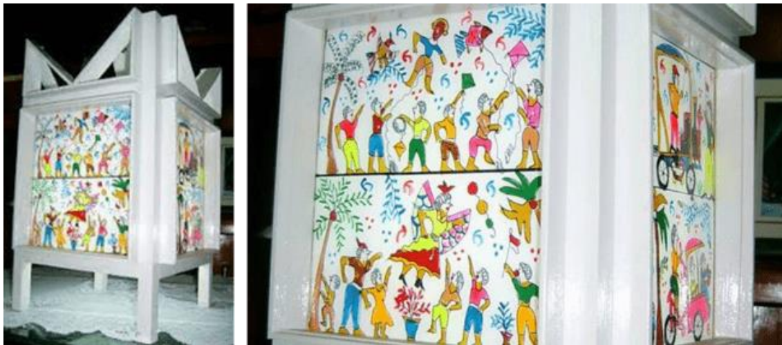
Fig. 8: Damar Kurung is Made of Fiberglass with An Electric Lamp