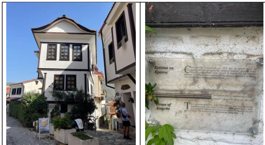
Fig. 1a: West side of the house

The inscription of the board that is put on the west side of the house of Krapche (Kanevche) (Fig 1a) has the following text: “The Kanevchevi family, in the 19 th century, has built one of the most typical facades found on the west side of the house, used as a model in making street lanterns that can be seen in the old part of Ohrid. The house is fully authentic and restored” (Fig 1b). The purpose of installing the board was to provide clear information to the numerous visitors, allowing them to easily understand the significance and essence of this landmark. By reading the information alongside some general details, tourists can comprehend the context better and create a memorable experience. Placing the board serves as an initiative to reinforce and promote Ohrid's cultural heritage, contributing to the development of cultural tourism in the region.