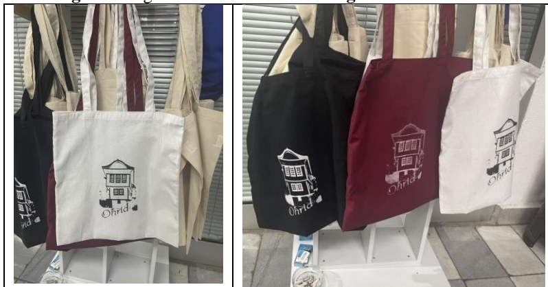
Fig. 6c: Bags