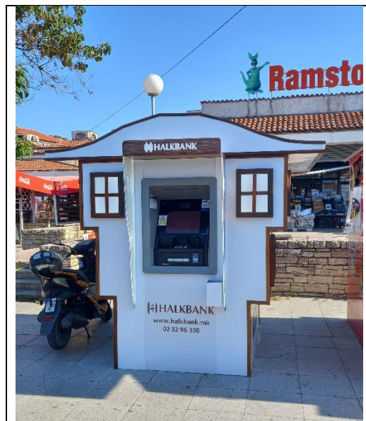
Fig. 5: ATM banking outlet

A substantial house-shaped wooden model (4m x 4m) (Fig 4) installed at Ohrid's main entrance in 2013 welcomes visitors, emphasizing the uniqueness of Ohrid's urban architectural heritage. Surrounded by horticultural elements, it creates a warm and inviting atmosphere.