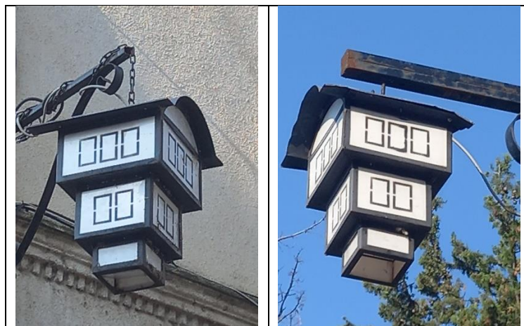
Fig. 3: Street lanterns