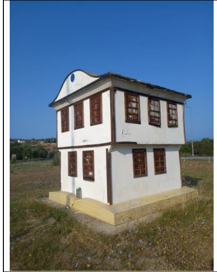
Fig. 4: “Welcome” model house

The street lanterns (Fig 3) represent the architectural features of the Krapche (Kanevche) house and can be found in the old town of Ohrid. These candelabras serve as typical decorations along the narrow streets, designed to mimic the shape of the west facade of the house model. They significantly enhance tourists' experience of a memorable walk through Ohrid's cultural architectural heritage.