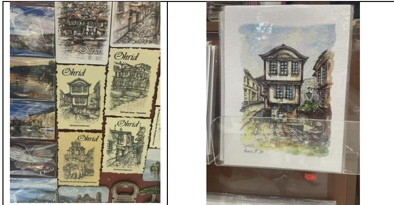
Fig. 6a: Magnets

cultural heritage but also contributes significantly to the promotion of tourism by showcasing the iconic shape of the house model.