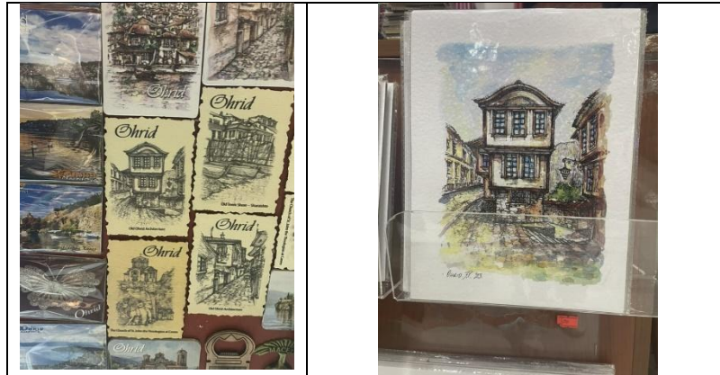
Fig. 6a: Magnets

perpetuate the spirit of Ohrid's cultural tradition. This initiative not only enhances the city's cultural heritage but also contributes significantly to the promotion of tourism by showcasing the iconic shape of the house model.