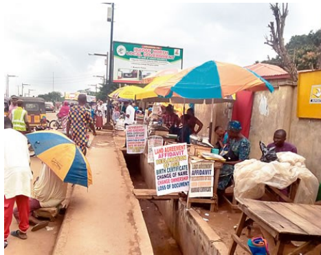
Fig. 1: Typists and touts hustling for customers at Agodi-Gate, Ibadan

Akinwale (2019) condemns the illegal and criminal activities of the issuance of affidavits by touts. Sani (2021) reported that despite the fair cost of obtaining affidavits in the different courts of Nigeria, a lot of Nigerians still prefer getting affidavits from illegal agents or touts at higher prices court reason being that the touts and their official collaborators do bypass checks and the compulsory need for a police extract or report. Nonetheless, any form of affidavit hawking is condemnable by law (Kunle, 2021).