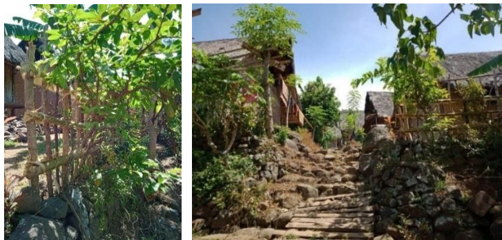
Fig. 2: The boundary fence in Dukuh Tonggoh: the 'inside' area of Dukuh Village