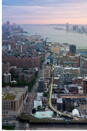
Fig. 1: Aerial view of the high line.