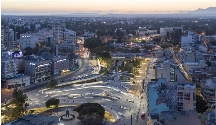
Fig. 5: Eleftheria Square Cyprus, Nicosia.

The redesign project of Eleftheria Square involved the utilization of non-destructive geophysical investigation techniques in Nicosia's urban environment. The primary objective was to gather subsurface information to minimize the impact of hazards on both existing historical buildings and newly constructed infrastructure. Methods such as electrical resistivity tomography (ERT), ground-penetrating radar (GPR), and induced electromagnetic (EMI) surveys were employed during different project phases to comprehend geological stratigraphy, detect buried objects (including archaeological structures and underground utilities), and address unexpected occurrences like water infiltration during construction (Cozzolino, Gentile, Mauriello & Peditrou, 2020).