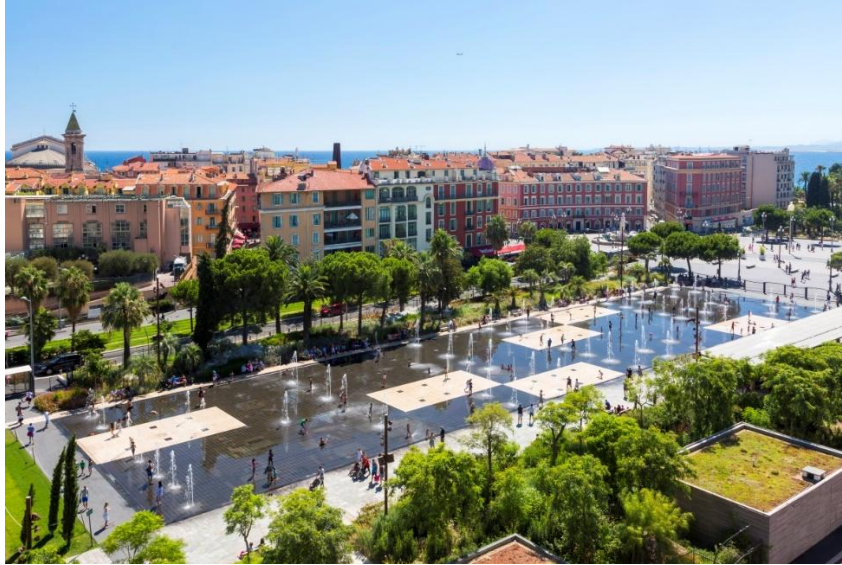
Fig. 3: The Promenade du Paillon is a veritable lung of greenery of 12 hectares in the heart of downtown nice.