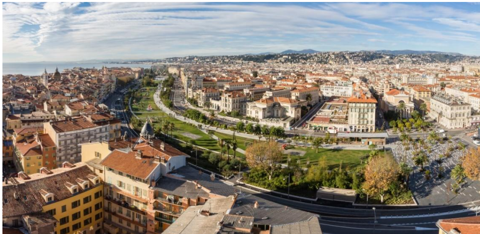
Fig. 4: Aerial view of Promenade Du Paillon, showcasing its vibrant green spaces and winding pathways.

In conclusion, Promenade du Paillon is an absolute must-visit destination for travelers exploring Nice, France. Its captivating ambiance, rich historical significance, and diverse attractions cater to visitors of all ages, promising an unforgettable experience.