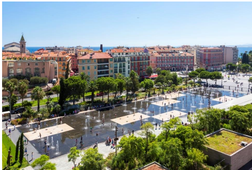
Fig. 3: The Promenade du Paillon is a veritable lung of greenery of 12 hectares in the heart of downtown nice.

The Paillon River, coursing through the park, serves as a crucial water source for the city. Nourished by an aquifer located beneath the park, the river is part of an extensive network of karstic aquifers within the Alpes-Maritimes region of France. Due to tectonic compartmentalization, the aquifer is subdivided into distinct zones, with its drainage influenced by Mesozoic pre-structuring and Alpine phase deformations. The karstic waters flow toward the Paillon valley depression and are channeled through plurikilometric faults, ultimately emerging at apparent sources such as Sainte-Thecle and Pissarelles, as well as hidden outlets in the Paillon valley alluvium and Upper Cretaceous limestones (Emily, 2000).