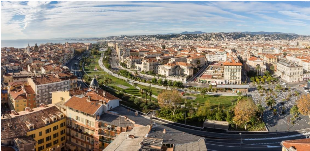
Fig. 4: Aerial view of Promenade Du Paillon, showcasing its vibrant green spaces and winding pathways.