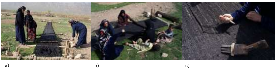
Fig. 7a, 7b, 7c : Nomadic women weaving a strip of Black Tent in Ilam Province

Beside the Black Tent in Iran, there are other examples of housing used by nomadic people like the Alachigh, Kapar or Mazif. Different characteristics are found in different geographical areas of Iran.