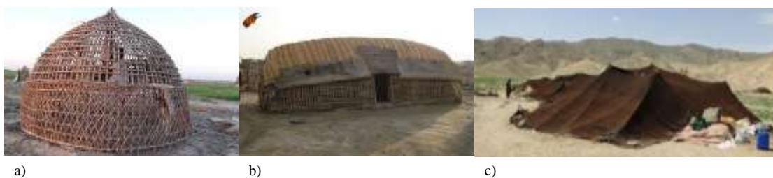
Fig. 2a: Kapar of Kerman province, Fig. 2b: Kapar of Sistan and Baluchestan province, Fig. 2c: Kapar of Khorasan province

Tents can also be found in the eastern and southeastern parts of the country, which includes parts of Khorasan, Sistan and Baluchestan, and Kerman and Hormozgan provinces (Fig.2a, Fig.2b, Fig.2c). Here special weather conditions prevail. In this area, climate diversity is severe, and in general, this region has low water levels and low rainfall with hot weather and a great difference in temperature overnight. Kapar is one such hut made in the southern part of Kerman province. Usually, huts in Kerman have a circular shape and in the Sistan and Baluchestan provinces the hut (kabar) has an ellipsoidal shape with a lower ceiling.