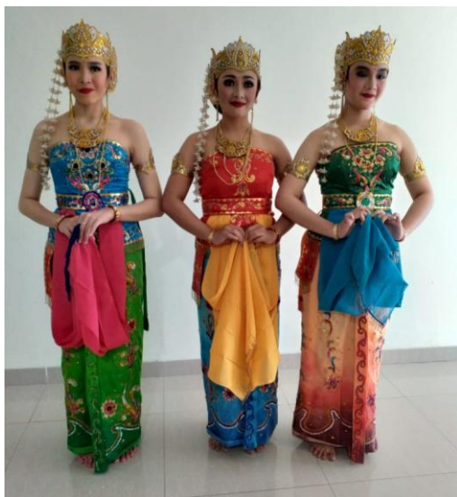
Fig. 1: Getting ready to dance