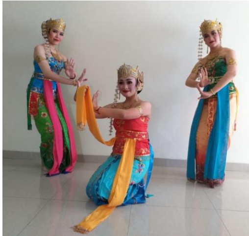
Fig. 3: Hand position nangreu and Position calik jengkeng (calik ningkat)