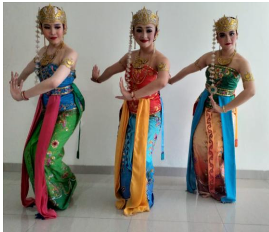
Fig. 5: Keupat Sambada movement