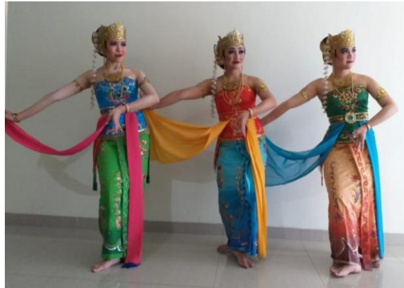
Fig. 4: Keupat Soder movement