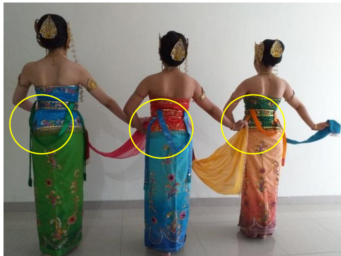
Fig. 6: Pita andong

Apok is worn to cover the chest, torso, and hips, while the upper back and shoulders are left open. Apok is a representation of clothing worn by women in Sundanese culture. It is worn by female dancers in several dances created by Tjetje Somantri.