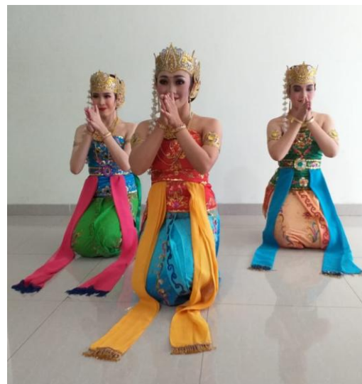
Fig. 2: Sembah movement