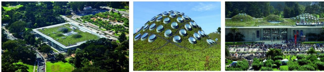
Fig. 1: The roof Garden project

Long term Viability: Renzo Piano's design prioritizes the long-term viability of the rooftop garden. Maintenance plans and sustainable practices, such as composting and organic pest control, ensure that the garden remains healthy and vibrant over time.