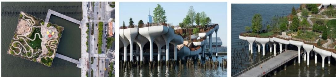
Fig. 2: Little island sustainable design

Urban Integration: The design aligns with the New York Street network, enhancing urban connectivity and accessibility while maintaining a green and natural atmosphere.