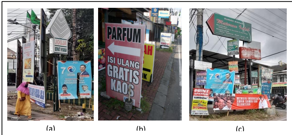
Fig. 4: Installation of billboards without permission and damage the beauty of the environment. (a) The sign/slogan 'Jogja has a Comfortable Heart' that does not match the slogan. (b) Public facilities (sidewalks) are covered with billboards. (c) Installation of banners, banners, signs/sign systems that are chaotic and overlapping

Physically, the placement of outdoor advertising media often disturbs the beauty of the urban environment (Borisova et al, 2017). In this context, the word 'space' is understood as a place that is the centre of attention for various interests. The advertisement placement space itself is not the only thing being targeted, but also because of the demand for 'aesthetic quality' which arises as a result of the changing behaviour and lifestyle of the people in urban areas. Hall et al. (2000) says that the high mobility of the population and the relationship between parts of the city result in parts of the city and urban spaces being frequently enjoyed by the citizens of the city. Talking about billboards is not only limited to promotional media, but also talking about urban planning which cannot be separated from its social and environmental aspects. Urban development and development activities are not only aimed at the convenience and security of the public but cannot be separated from the beauty or aesthetic aspects of the city and its environment.