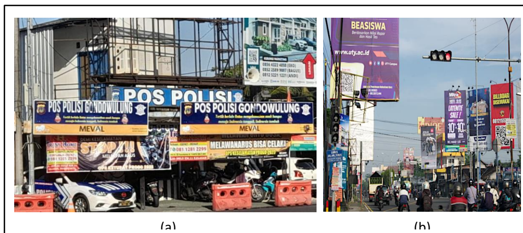
Fig. 3: Advertising media installed in public spaces. (a) The police station (b). The T-junction/crossroads

The presentation of visual data in the field as well as the interviews with several informants, confirmed that the placement of advertisements or billboards in Yogyakarta contained problems. The results of analysis in the field also show that the massive advertising in public spaces is spread out at various points/places. Most of them have been installed without permits, without heeding the ethics and aesthetics of the city environment.