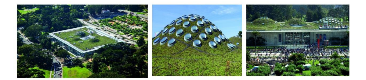
Fig. 1: The roof Garden project

Long term Viability : Renzo Piano's design prioritizes the long-term viability of the rooftop garden. Maintenance plans and sustainable practices, such as composting and organic pest control, ensure that the garden remains healthy and vibrant over time.