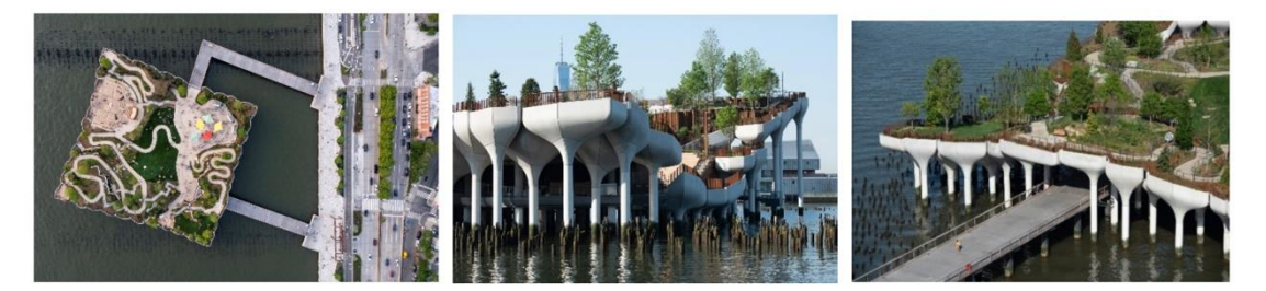
Fig. 2: Little island sustainable design

Urban Integration : The design aligns with the New York Street network, enhancing urban connectivity and accessibility while maintaining a green and natural atmosphere.