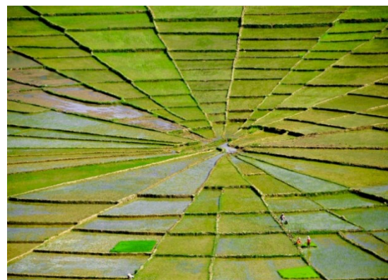
Fig. 3: Lingko land architecture