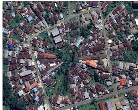
Fig. 5: Modernization of Lingko land in Tenda Village, Manggarai Regency

In line with the passage of time, the form of the mbaru drum has undergone an evolution that cannot be ignored. Changes in the appearance of a house are caused by two fundamental factors, namely socio-cultural factors, which are the main factors, and other supporting factors, including climate, land topography,