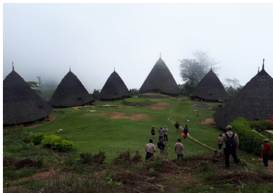
Fig. 2: Mbaru gendang traditional house architecture