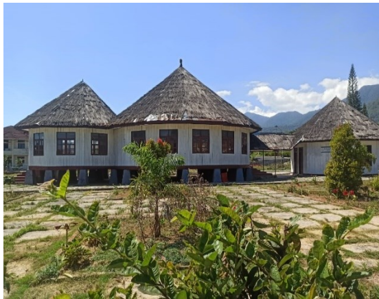
Fig. 4: Contemporary Adaptations to Traditional Houses

It is undeniable that the factors that play a role in this change come from within the community, the evolution of peoples's lifestyles, and also from external influences such as national policies, the boom in the tourism sector, vibrations from the effects of globalization, and various other dynamics that are no less interesting.