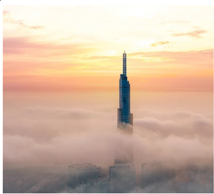
Fig. 1 : Vinpearl Landmark 81

In urban areas like Hanoi and Ho Chi Minh City, rapid modernization and urbanization have created new power dynamics. Apartments in high-rises symbolize upward mobility, i.e. Vinpearl Landmark 81 is the highest hotel in Vietnam (Marcus, 2023), while older, communal-style houses represent a more traditional way of life. The allocation of space and access to amenities can reflect disparities in wealth and social status.