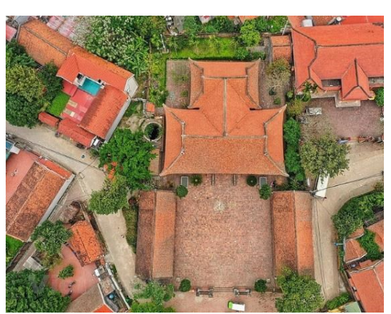
Fig. 3: Mong Phu communal house from the air

Moreover, the recent trend of rural-to-urban migration has created a dynamic tension between traditional values and urban aspirations, further impacting power dynamics within domestic spaces.