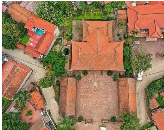
Fig. 3: Mong Phu communal house from the air

Moreover, the recent trend of rural-to-urban migration has created a dynamic tension between traditional values and urban aspirations, further impacting power dynamics within domestic spaces.