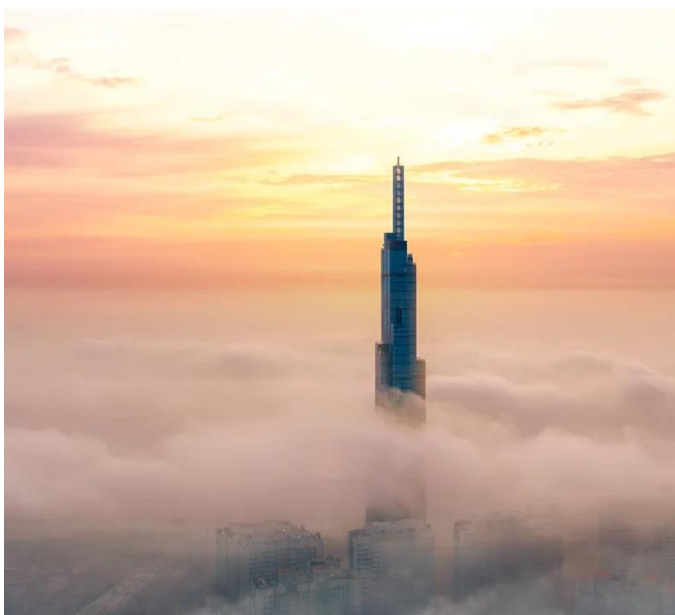
Fig. 1: Vinpearl Landmark 81

In urban areas like Hanoi and Ho Chi Minh City, rapid modernization and urbanization have created new power dynamics. Apartments in high-rises symbolize upward mobility, i.e. Vinpearl Landmark 81 is the highest hotel in Vietnam (Marcus, 2023), while older, communal-style houses represent a more traditional way of life. The allocation of space and access to amenities can reflect disparities in wealth and social status.