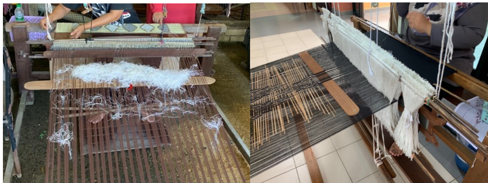
Fig. 5: The use of traditional “Karak” and 'heddle eye' on a loom

Songket is a painstaking and time-consuming process that requires the skills of trained weavers. The traditional procession process was now replaced by 'heddle eye' to shorten the process to one to two days only. Innovations created in Songket manufacturing techniques have saved weaver's time and increased productivity.