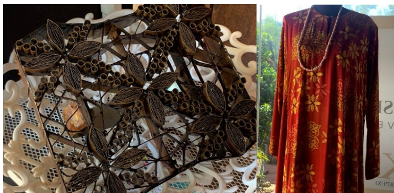
Fig. 4: Batik Block with Black pepper motif and Kaftan shirt with black pepper motif.