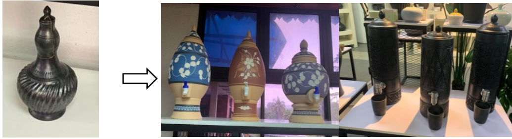
Fig. 2: Labu Sayong style 'water dispenser' with a modern design.

In comparison, hybrid elements can also be seen through the creativity of Johor Batik entrepreneurs, who combine the 'Shibori tie dye' technique with the Johor stamp Batik motif. The Shibori technique is a shirt dyeing technique that originated in Japan. Shirts or other textiles will be tied in a certain way to create a unique motif when soaked in dye. This fashion has become a 'trend' that most of today's teenagers follow. This modern technology is combined with batik cap techniques with Johor batik elements, making it unique and interesting to style.