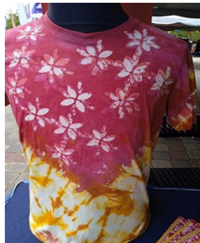
Fig. 3: 'Shibori tie dye' shirt combined with batik stamp technique.

In comparison, hybrid elements can also be seen through the creativity of Johor Batik entrepreneurs, who combine the 'Shibori tie dye' technique with the Johor stamp Batik motif. The Shibori technique is a shirt dyeing technique that originated in Japan. Shirts or other textiles will be tied in a certain way to create a unique motif when soaked in dye. This fashion has become a 'trend' that most of today's teenagers follow. This modern technology is combined with batik cap techniques with Johor batik elements, making it unique and interesting to style.