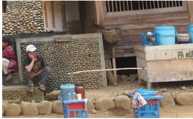
Fig. 11. Stones used in the Houses in Kampung Naga