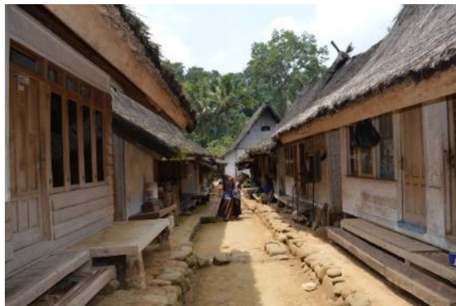
Fig. 8: Circulation Path Between Residential Houses in Kampung Naga