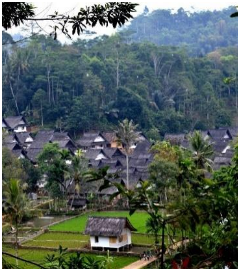
Fig. 6: The Culture of Respecting Nature in Kampung Naga