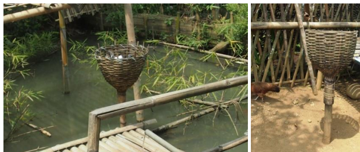
Fig. 10. Trash Cans in Kampung Naga