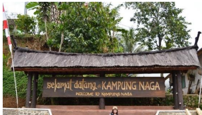
Fig. 12. Gate in Kampung Naga