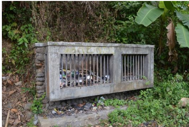
Fig. 9. Garbage Enclosure in Kampung Naga