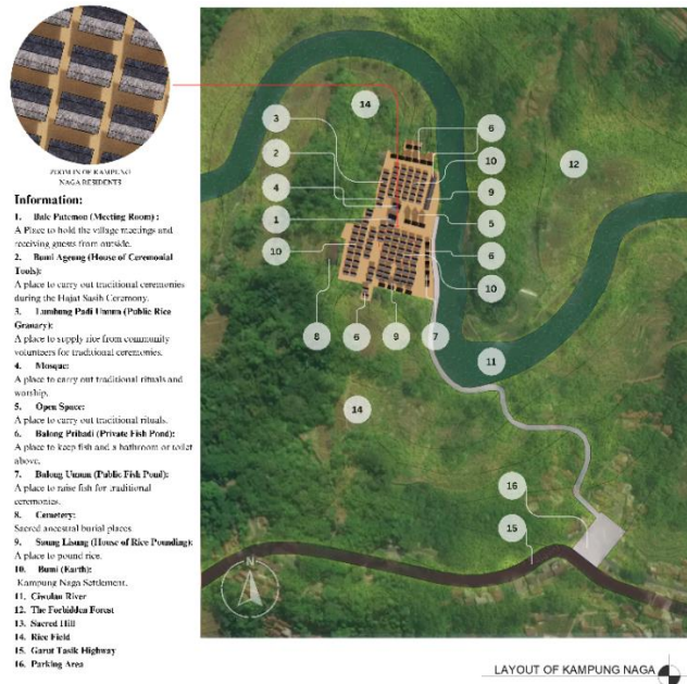
Fig. 2. Siteplan of Kampung Naga

The location of the settlements in Kampung Naga has a pattern that spreads according to the availability of land based on the customary rules. Most houses face each other and are required to face North and South. The landscape of Kampung Naga is hills with fertile soil (Fig. 2). It consists of three parts: the forest area, the residential area, and the outer area (dirty area). In this pattern, there are three elements which mutually support the fulfillment of the daily needs: 1) The house is as a place to live, and shelter from the wild animals. Sundanese houses use natural materials and are friendly to the environment; 2) A source of water is always available for the fulfillment of survival, whether raising fish, irrigating rice fields, cultivating crops, or for other needs; and 3) The pattern of the settlements, and the village spatial planning maintain the contour patterns and environmental balance.