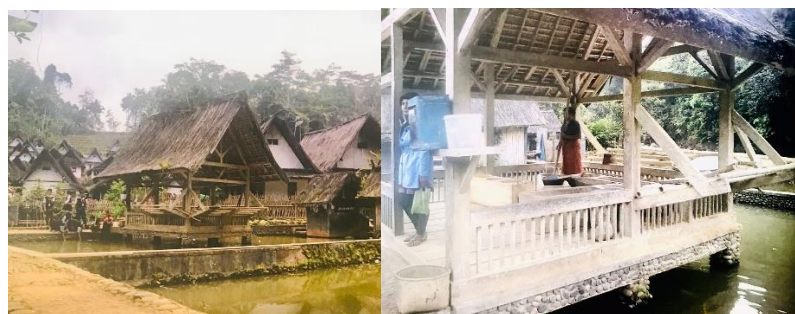
Fig. 13. Saung Lisung in Kampung Naga