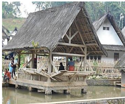
Fig. 4: Saung Lisung in Kampung Naga