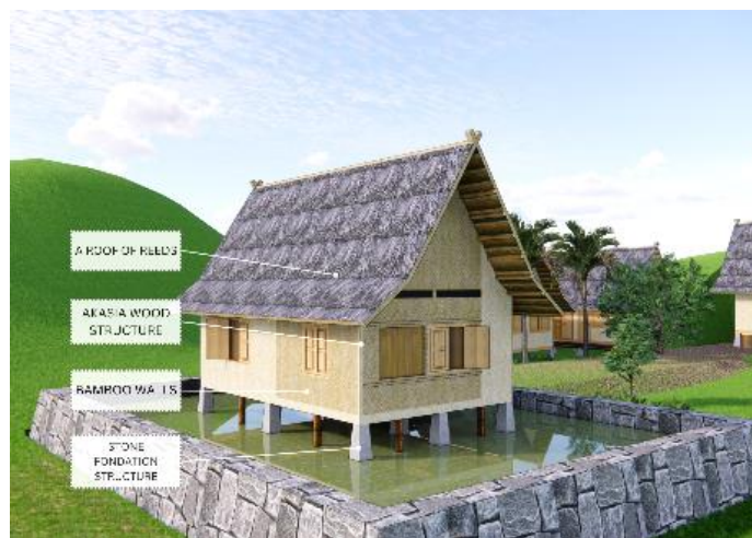
Fig. 5: The House of Kampung Naga