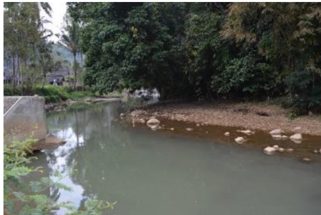
Fig. 7: Ciwulan River