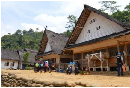
Fig 3: Bale Patemon and Kampung Naga Mosque