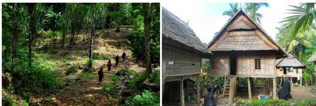
Fig. 3: (left) Conservation of the forest is a hallmark of the customary community (right) The principle of balance within nature is also evident in Ammatoan dwellings, for their lives and activities are one with the environment.

Another adaged holds, Anjo natahang ri boronga karana pasang. Rettopi tanayya rettoi ada (“The forest may endure because of [our] customs; should the land crumble, so too will the customs of the Ammatoa ”).