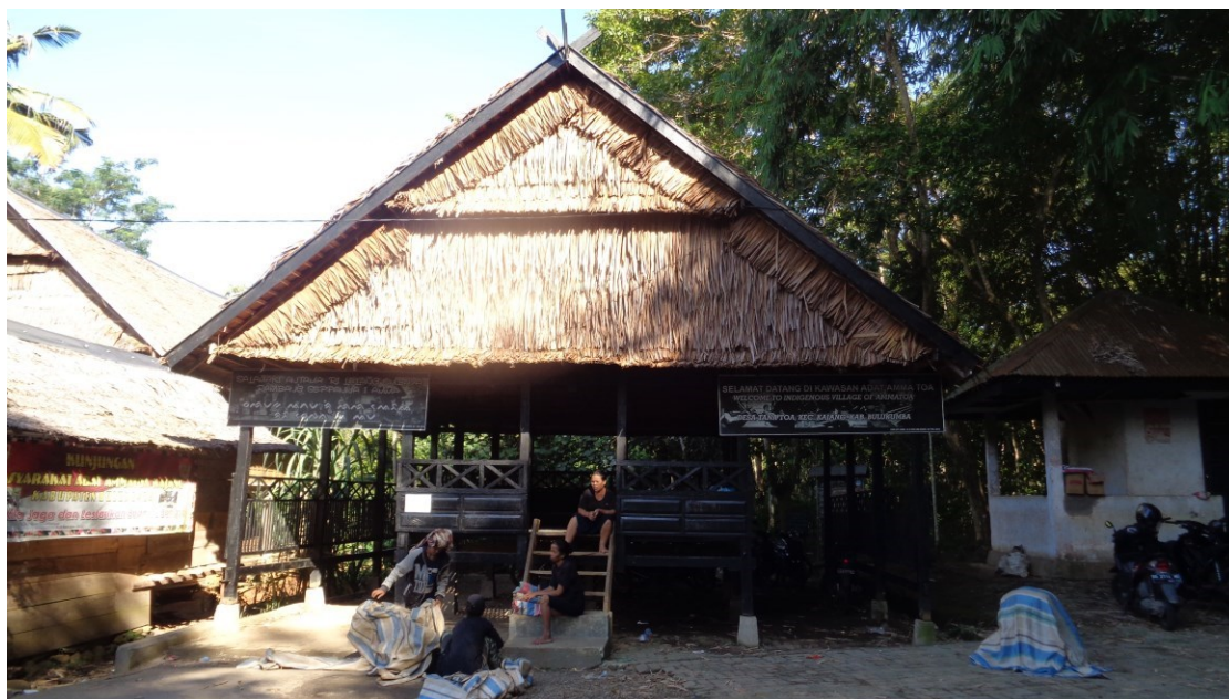
Fig. 2: Gateway to the Ilalang Embaya