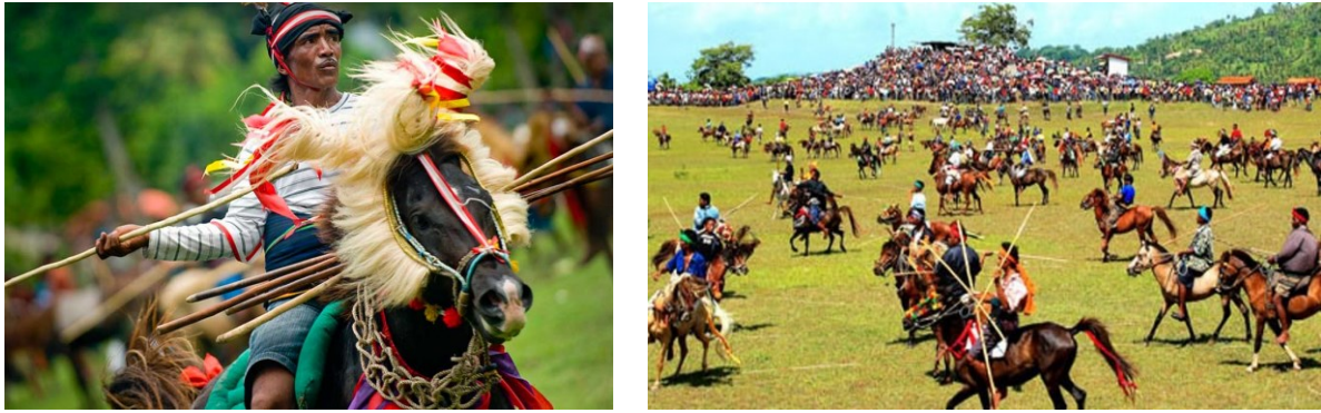
Fig. 1: Pasola Tradition and the clothes

Pasola tradition is a cultural history abundant with important lessons for living. When the history of this custom is investigated in great detail, there are numerous lessons and insights that can be imparted to the community. Within the parameters of this discussion, it is possible to discover a number of significant values.