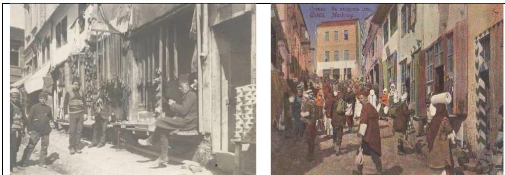
Fig. 4: Past outlook of the Old Bazaar

Contrasting Fig. 3 (current outlook) with Fig. 4 (past outlook) highlights that the Old Bazaar is under significant stress in terms of socio-cultural and aesthetic pressure. Local supply-enablers prioritize the economic benefits of tourism over concerns about socio-cultural and environmental damage. This prioritization of economic advantages over the preservation of the cultural identity of the Old Bazaar raises the question of re-evaluating the current monitoring system for safeguarding cultural heritage.