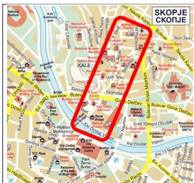
Fig. 1: Location of the Old Bazaar in the city core of Skopje, North Macedonia