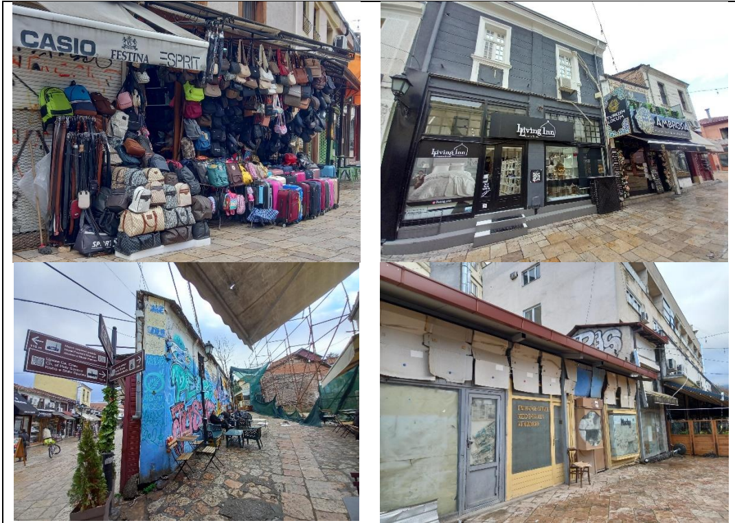
Fig. 3: Current outlook of the Old Bazaar