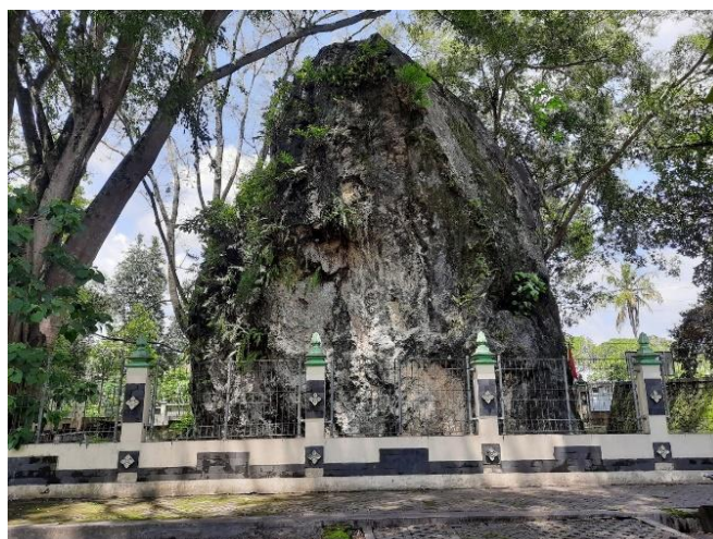
Fig. 4: Mount Gamping site in 2023

The records also describe that in the 1750s there was massive mining of Mount Gamping, coupled with the need for the Yogyakarta Mataram Kingdom to build the palace area. Massive exploration of Mount Gamping for the needs of palace construction occurred in 1755-1756. In fact, the royal government at that time issued a Pranatan in 1883 which allowed the exploration of Mount Gamping. Eventually, the continuous excavation left only a 10 m high boulder in the 1950s. The site was successfully immortalized by Swiss geologist Werner Rothpletz in 1956, showing the remaining Eocene limestone boulders (Boli, 2022). The following is a picture of the current Gunung Gamping site that was successfully captured by researchers.