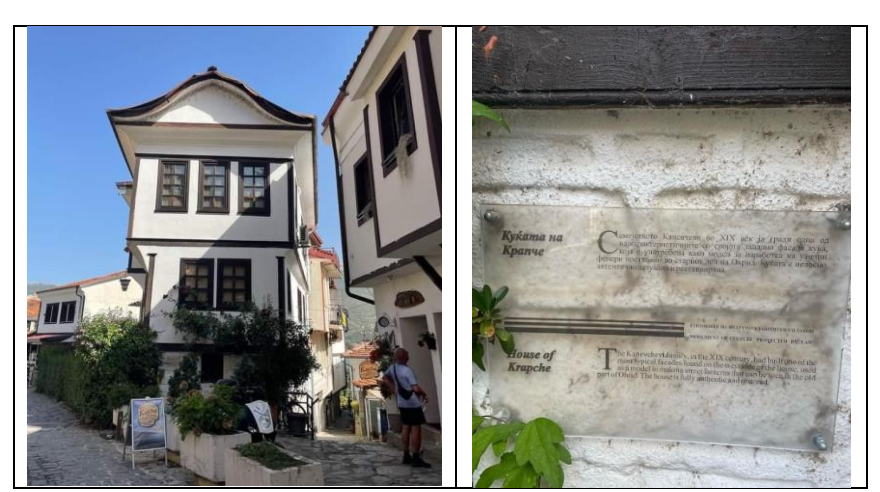
Fig. 1a: West side of the house Fig. 1b: Information board Fig. 1: House of Krapche (Kanevche), Ohrid

The inscription of the board that is put on the west side of the house of Krapche (Kanevche) (Fig 1a) has the following text: "The Kanevchevi family, in the 19th century, has built one of the most typical facades found on the west side of the house, used as a model in making street lanterns that can be seen in the old part of Ohrid. The house is fully authentic and restored" (Fig 1b). The purpose of installing the board was to provide clear information to the numerous visitors, allowing them to easily understand the significance and essence of this landmark. By reading the information alongside some general details, tourists can comprehend the context better and create a memorable experience. Placing the board serves as an initiative to reinforce and promote Ohrid's cultural heritage, contributing to the development of cultural tourism in the region.