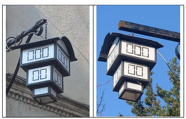
Fig. 3: Street lanterns