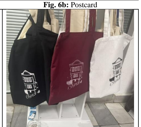
Fig. 6c: Bags Fig. 6: Souvenirs

In line with Decrop and Masset's typology (2011), magnets (Fig 6a) and postcards (Fig 6b) are symbolic souvenirs due to their typical and emblematic nature, while bags (Fig 6c) are utilitarian as they serve a functional purpose. These souvenirs (Fig 6), often chosen as gifts, reflect tourists' sensitivity to the authenticity embedded in their memories, images, and photographs, associating them with the specific house model's cultural and historical value. Tourists associate the bought souvenirs with the specific house model, which holds cultural and historical value for them as highlighted by Littrell et al., (1994).