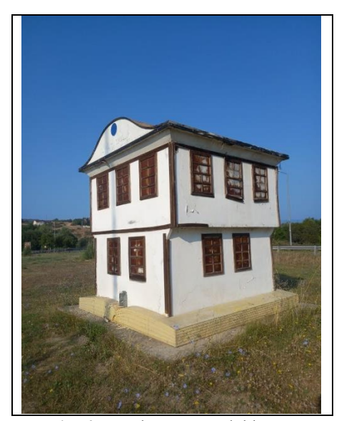
Fig. 4: "Welcome" model house

The street lanterns (Fig 3) represent the architectural features of the Krapche (Kanevche) house and can be found in the old town of Ohrid. These candelabras serve as typical decorations along the narrow streets, designed to mimic the shape of the west facade of the house model. They significantly enhance tourists' experience of a memorable walk through Ohrid's cultural architectural heritage.