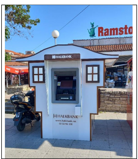
Fig. 5: ATM banking outlet

A substantial house-shaped wooden model (4m x 4m) (Fig 4) installed at Ohrid's main entrance in 2013 welcomes visitors, emphasizing the uniqueness of Ohrid's urban architectural heritage. Surrounded by horticultural elements, it creates a warm and inviting atmosphere.