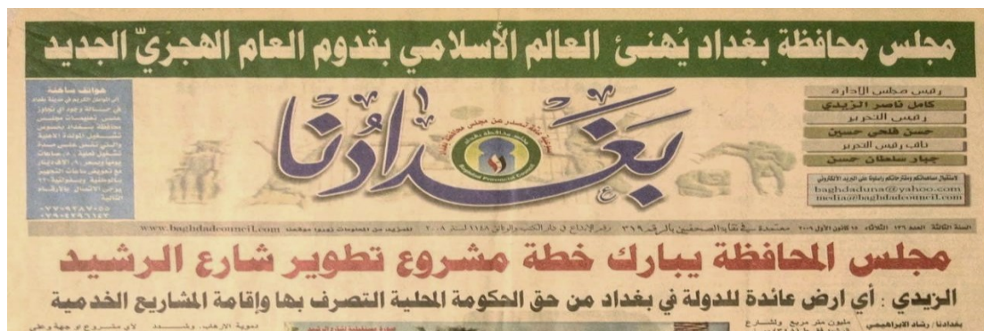
Fig. 5: The publication of the first news with regard to the development of Al-Rasheed Street in Baghdadna magazine for the year 2008.

The first piece of news was published in Baghdadna newspaper (Fig. 4), “the provincial council launches the plan for the development of Al-Rasheed Street,” but it is Baghdadi’s dreams and wishes that were neglected without knowing the reasons. Since then, the neglect has led to the dissolution of the old buildings, and it has become difficult to control them, which has led to their demolition. The regeneration method was used to change its function (Al-Waeli, 2017).