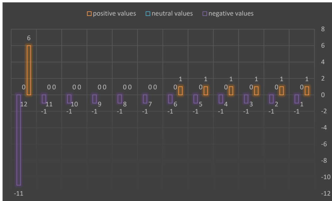
Fig. 8: The amount of values