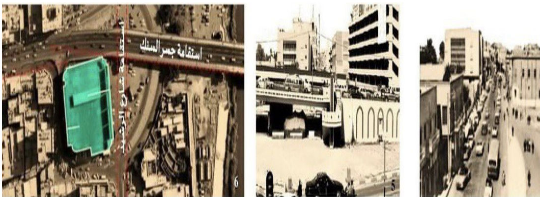
Fig. 4: The straightness of the Al-Sinak bridge before and after its construction