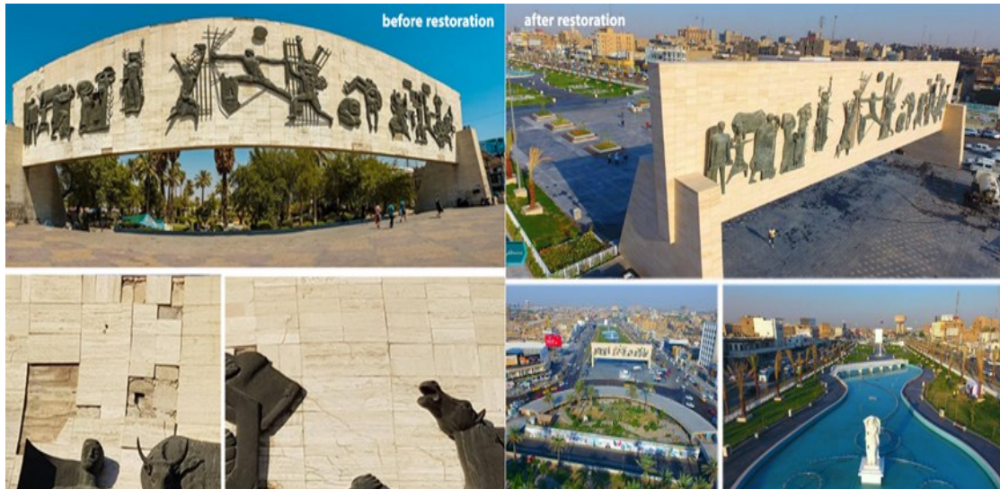
Fig. 2: The Freedom Monument before and after the restoration

After the completion of the process, the restoration process faced a torrent of both rejection and acceptance, despite the fact that the added material was structurally close to the colour of the original stone. In addition, the nation's square near the monument was redeveloped