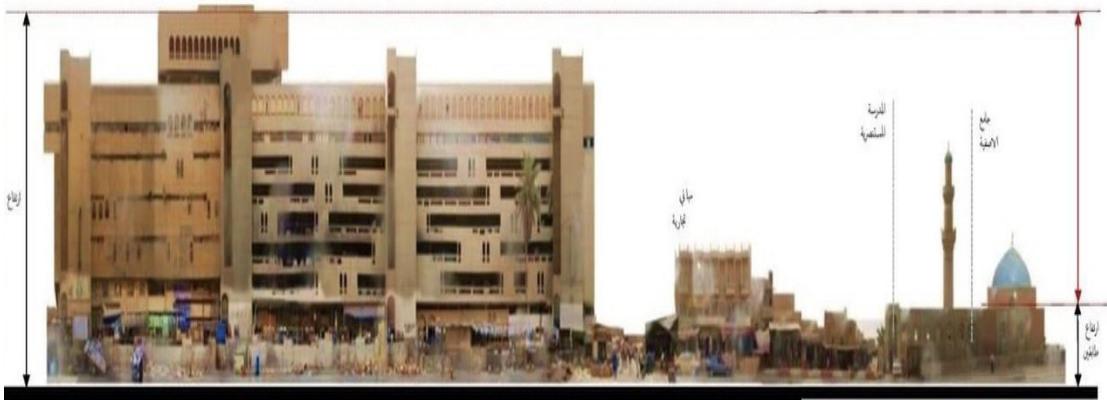
Fig. 3: The negative impact of parking lots on the height of the urban landscape shows the loss of contextual value

A project to renovate the city centre was launched by adding multi-story car parks. Through this project, three buildings designated as car parks were demolished. At the same time, two bridges were constructed, one in Sinak and the other in Bab al-Moadam, which resulted in a significant negative impact on parking lots due to the great discrepancy between the urban character of the Old City and the skyline of the car park. As for the Sinak Bridge, which was built in a way that lacks urban and aesthetic values, the "frustrating urban landscape" was completed by adding a car park that does not match the contextual values of the site.