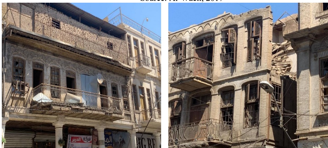
Fig. 6: The disintegration of old buildings, many of which were removed as a result of the Baghdad Municipality's neglect of the decision issued in 2009 to develop Al-Rasheed Street.