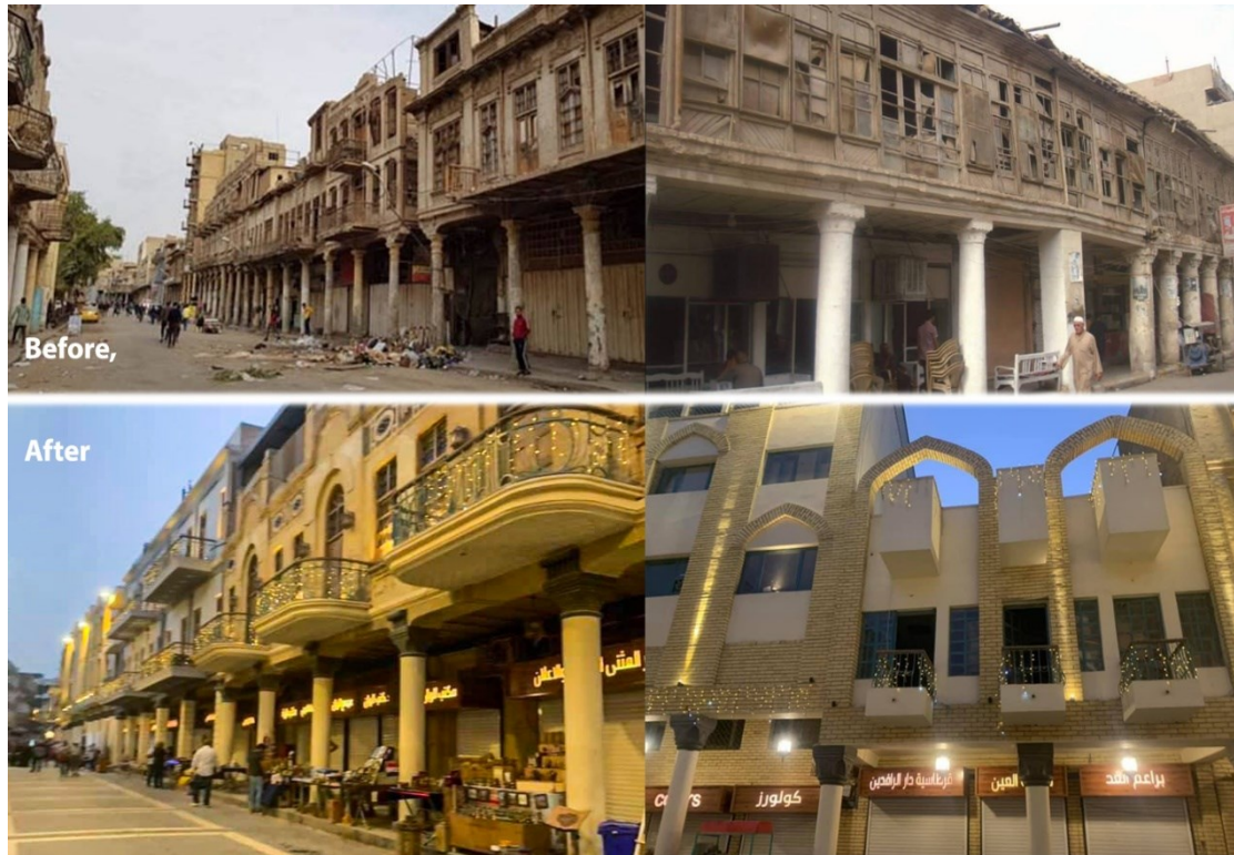
Fig. 7: The rehabilitation of Al-Rasheed Street before and after 2019

The main objective of the plan was to restore life to the historic centre of Baghdad, which reflects the civilization of the city, and to stimulate economic and social potential. But this process is not achieved by painting buildings, replacing sidewalls, restoring windows, planting gardens or installing lights...etc. These are just patch worked operations.