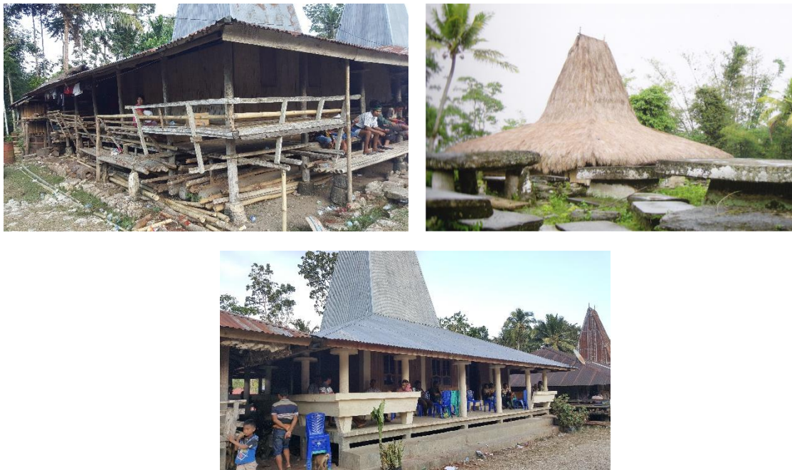
Fig 8: Conditions before (above) and after changing the materials (below)

Building activities that originally used wood, bamboo and stone now use modern materials such as cement, concrete and zinc (Fig. 8). Changes to the buildings' exterior are seen on the terrace of the house ( helama ). The terrace was originally a living room but is currently used to receive tourists. Furthermore, new table and chair furniture have been added to welcome the tourists.