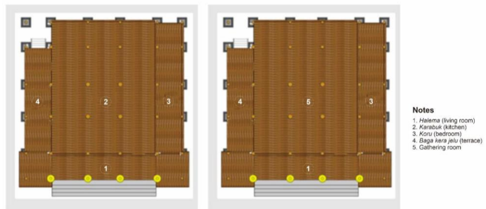
Fig 7: Conditions before (left) and after changing the spaces (right)