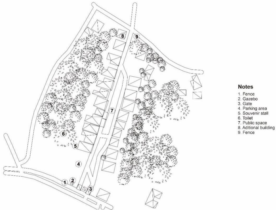
Fig 3: The condition after the construction of commercial facilities

The spatial layout of the Pasunga Village has changed in response to the tourism developments. The changes include additional tourist vehicle parking areas, souvenirs, and culinary stalls, fences and village gates (Fig 3).