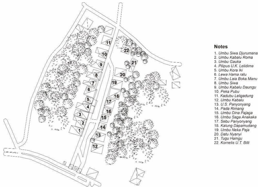
Fig 1: Building Structure in the Pasunga Village

storing the water supply and Uma labunaga . Fig 1 shows the arrangement of the buildings in the Pasunga village.