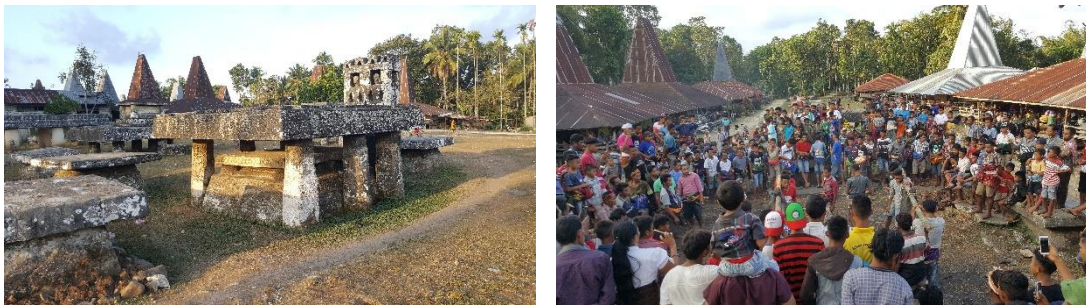
Fig 4: A megalithic tombstone/sacred area

Tourism support facilities are built at the front to ease tourist access. Meanwhile, the center which was originally a megalithic tombstone or sacred area ( talora adung ) has turned into a public area. It is an area for tourists to witness the traditional ceremonies, as illustrated in Fig. 4 and 5.