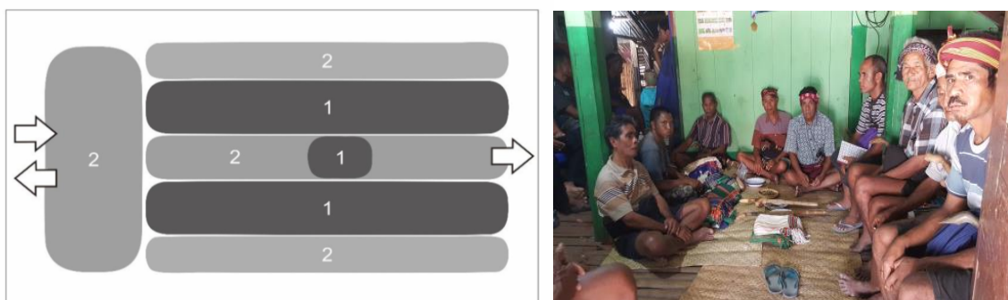
Description: 1) fixed zone, 2) changing zone Fig 6: Changes of the building layout

Changes at the village scale occur in the form of the arrangement of buildings, whose layout was originally circular and faced each other. The shape of the buildings changes to a series and stretches from front to back, as depicted in the Fig. 6. However, tourism activities did not change the shape of the houses, except for the furnace. The furnace was located originally in the middle of the house but has been moved to the back. This is because the center of the house is used as a common room to gather for discussions about the customs. The details are shown in the Fig. 7.